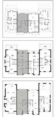
153 Vansittart Road