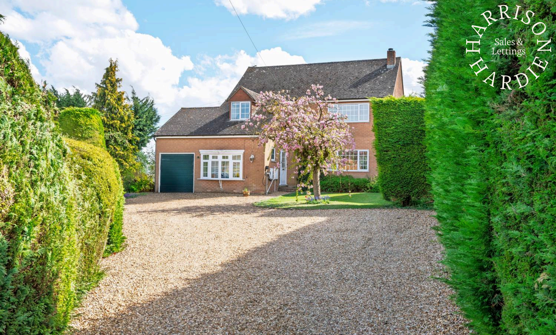
Griffin Close, Stow On The Wold