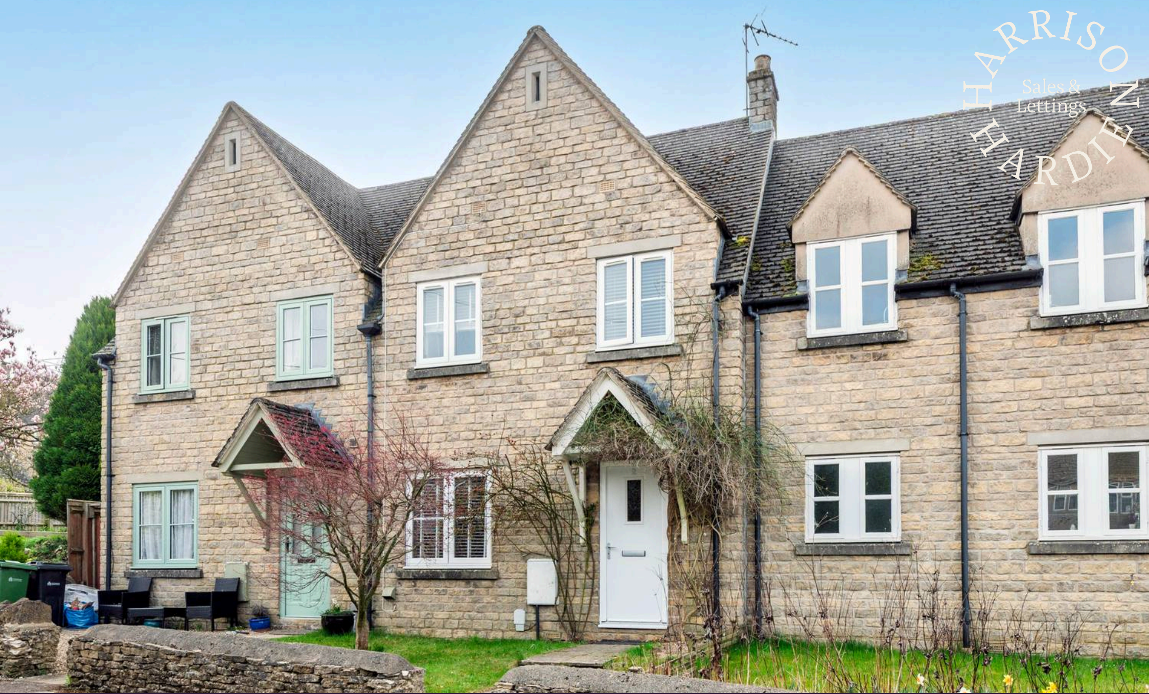
The Pound, Pound Lane, Little Rissington