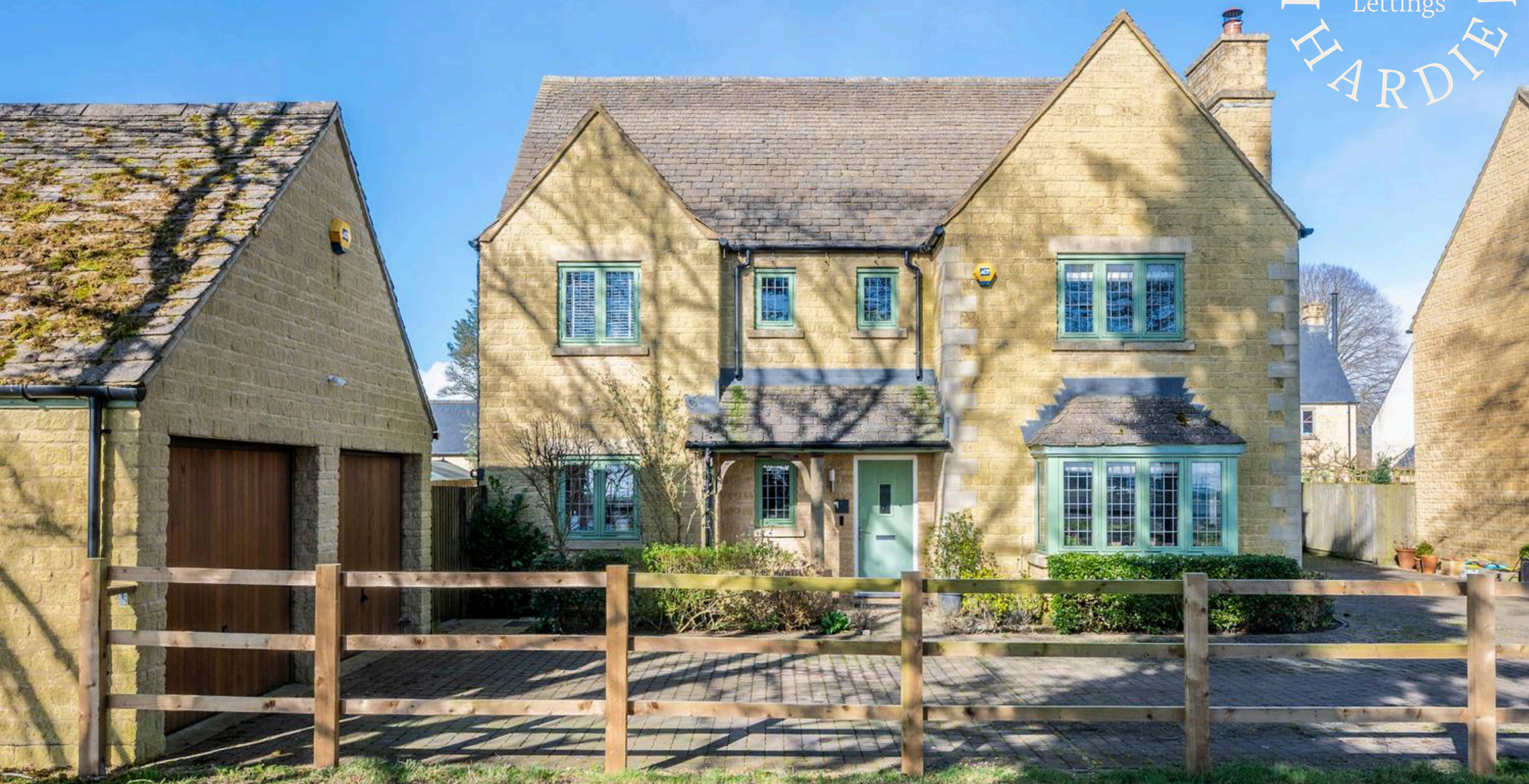
Sparrows Way, Upper Rissington