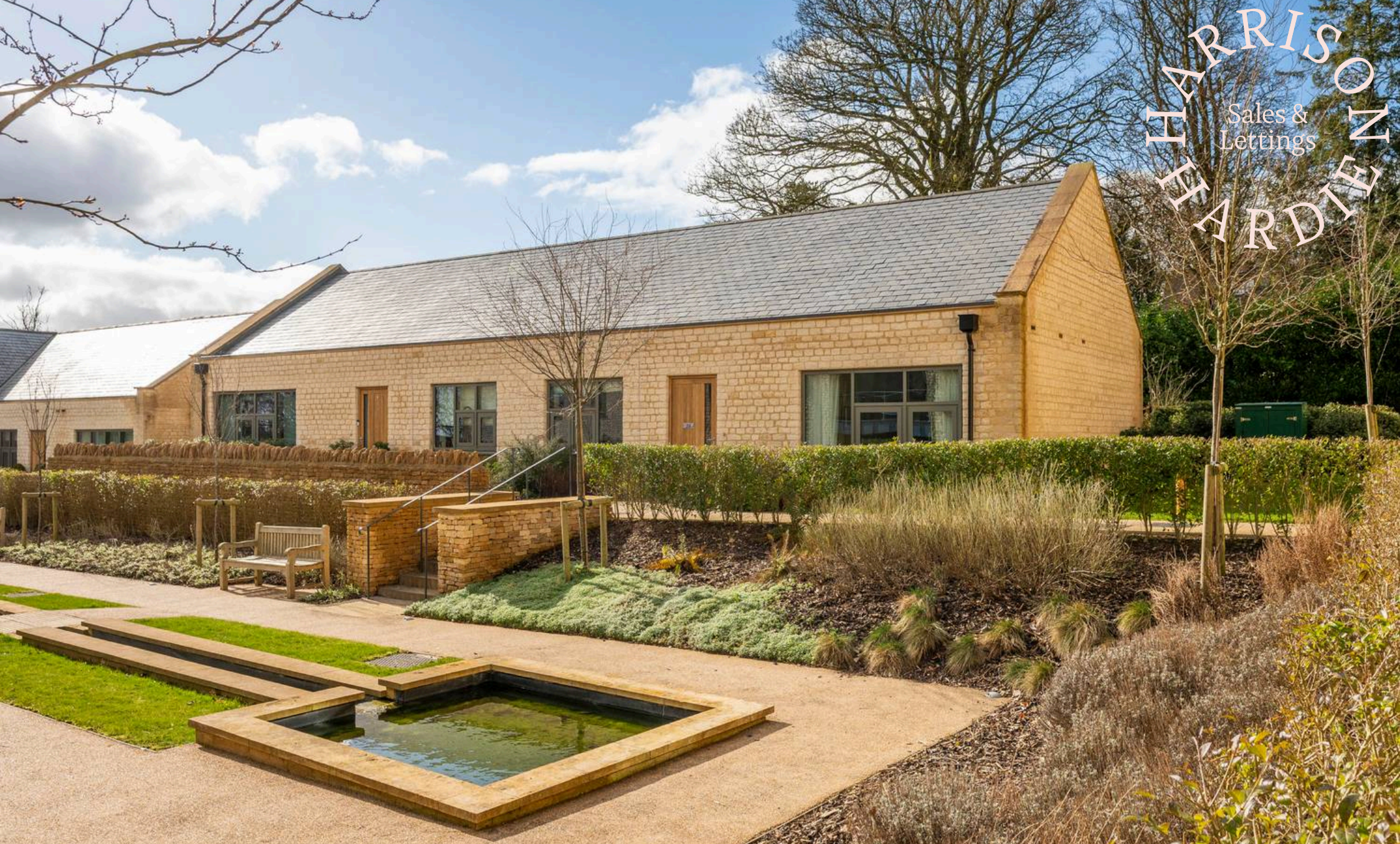
Bluebell Court Beechwood Park, Stow On The Wold Cheltenham