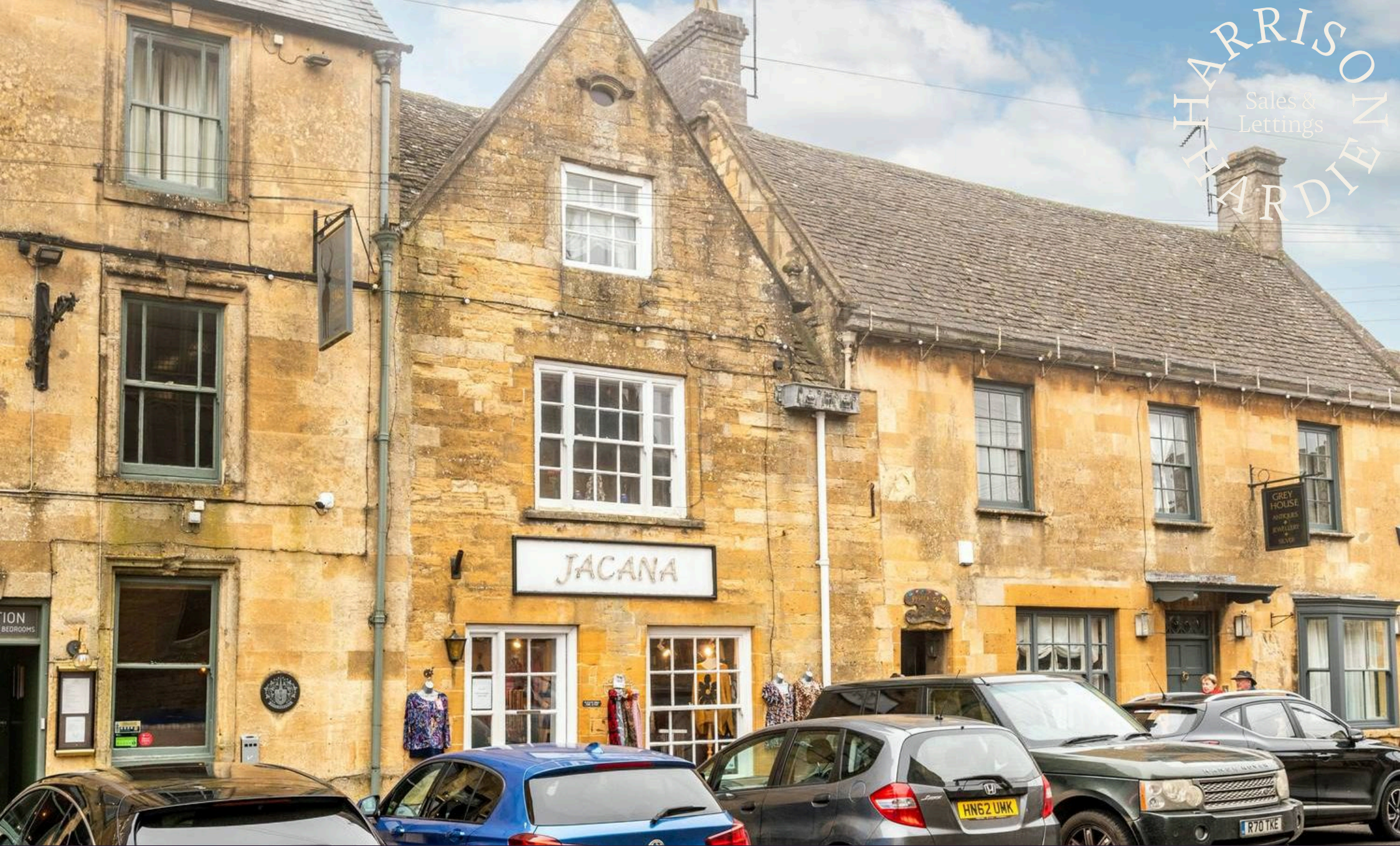
The Square, Stow-on-the-Wold