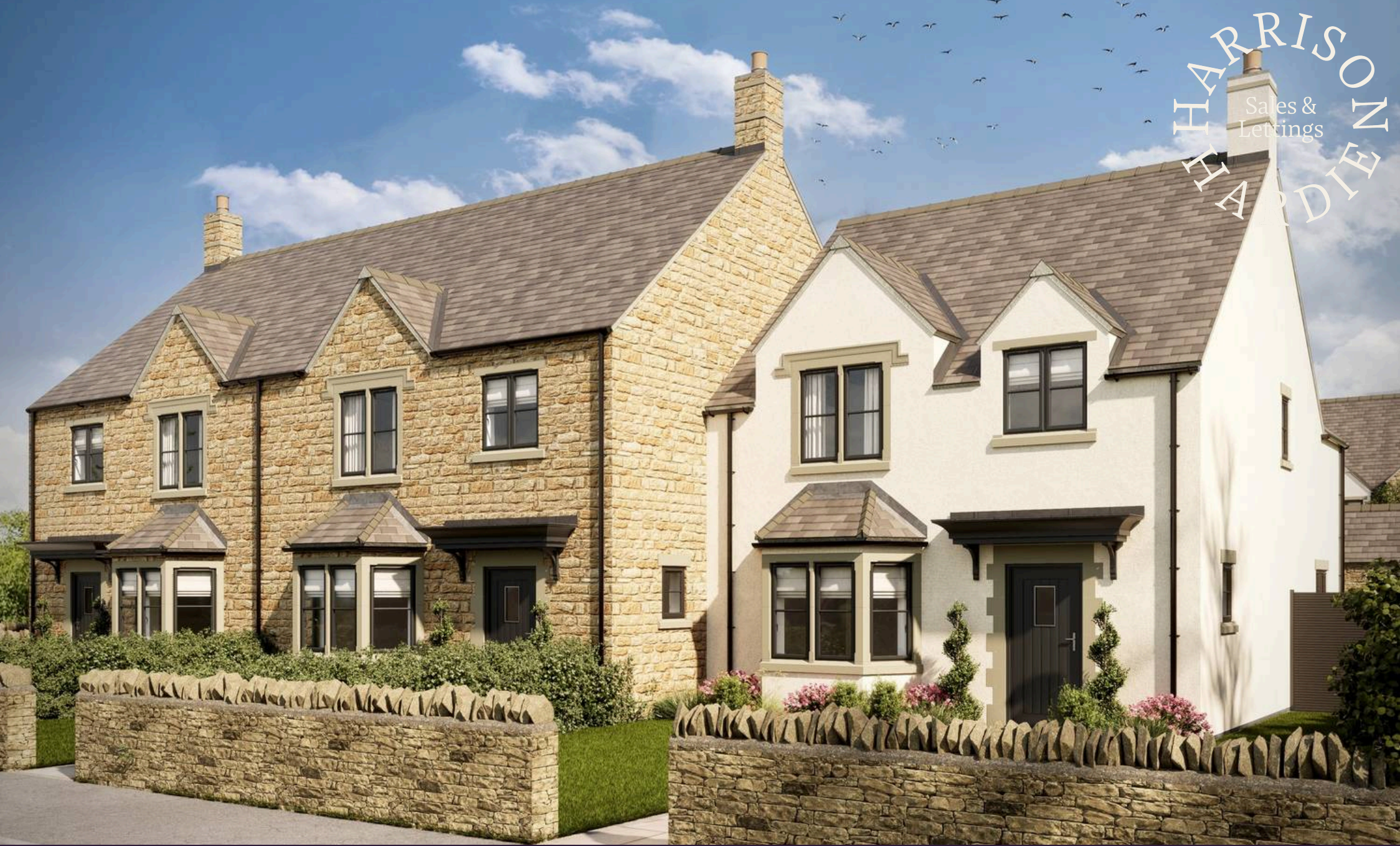
Plot 3, Bourton-on-the-Water, Station Road