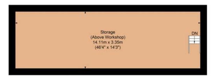
Workshop & Office Storage First Floor