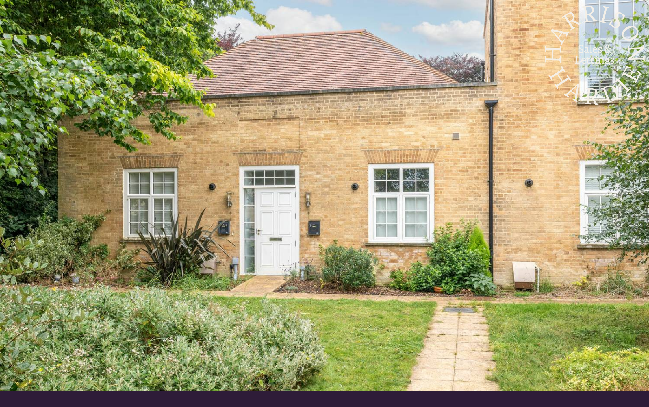
Valiant House, Upper Rissington