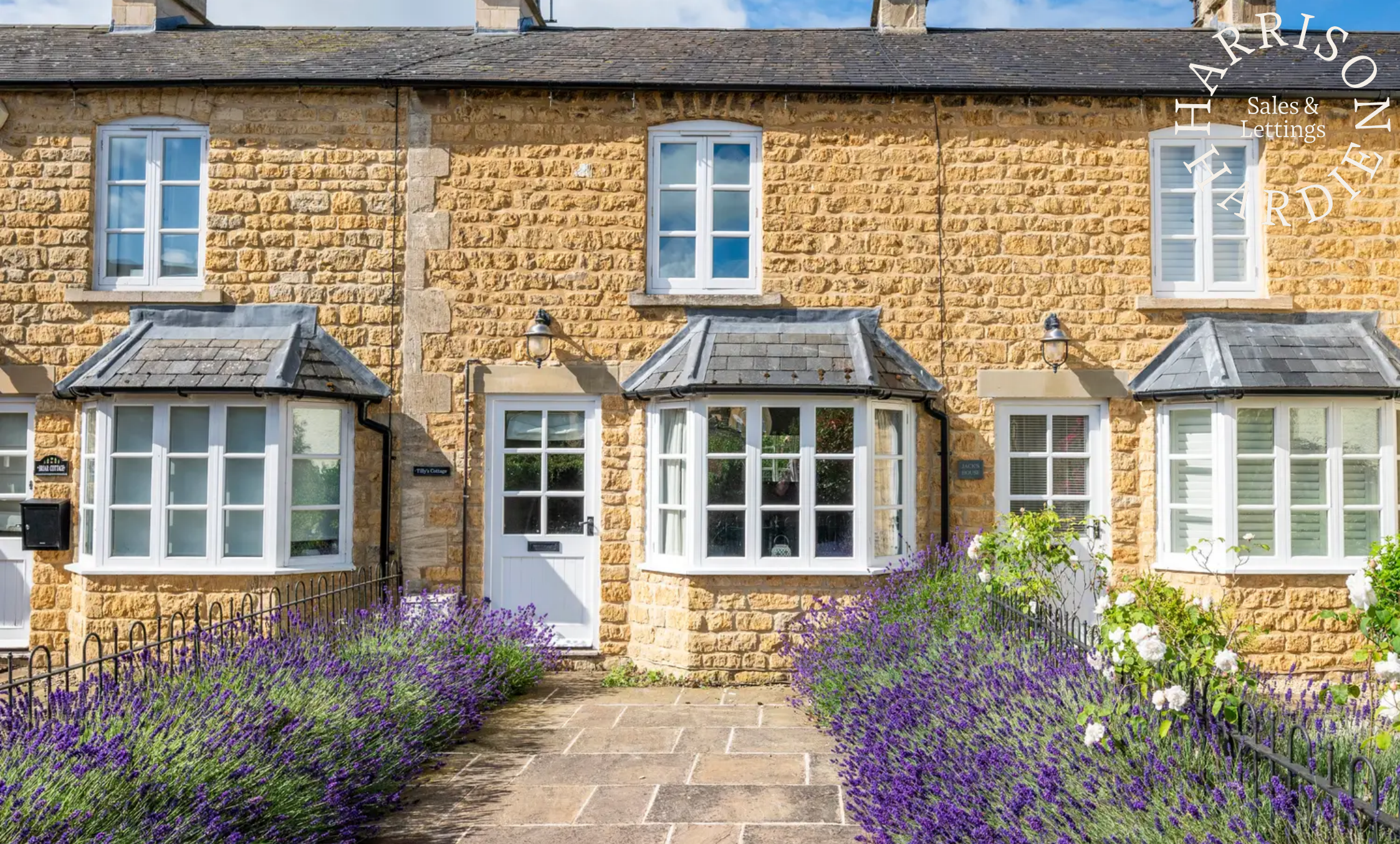
Clapton Row, Bourton-On-The-Water GL54 2DN