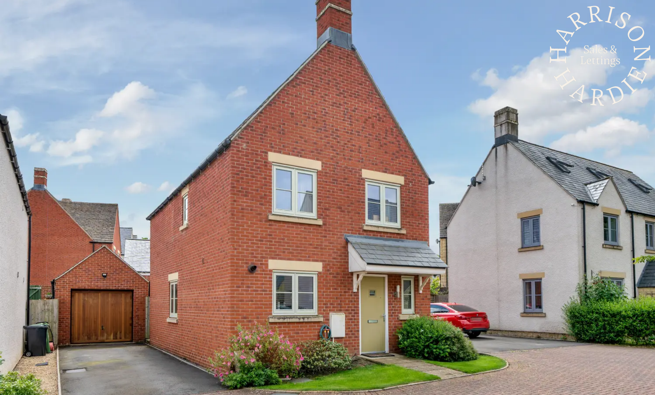
Beechcraft Road, Upper Rissington