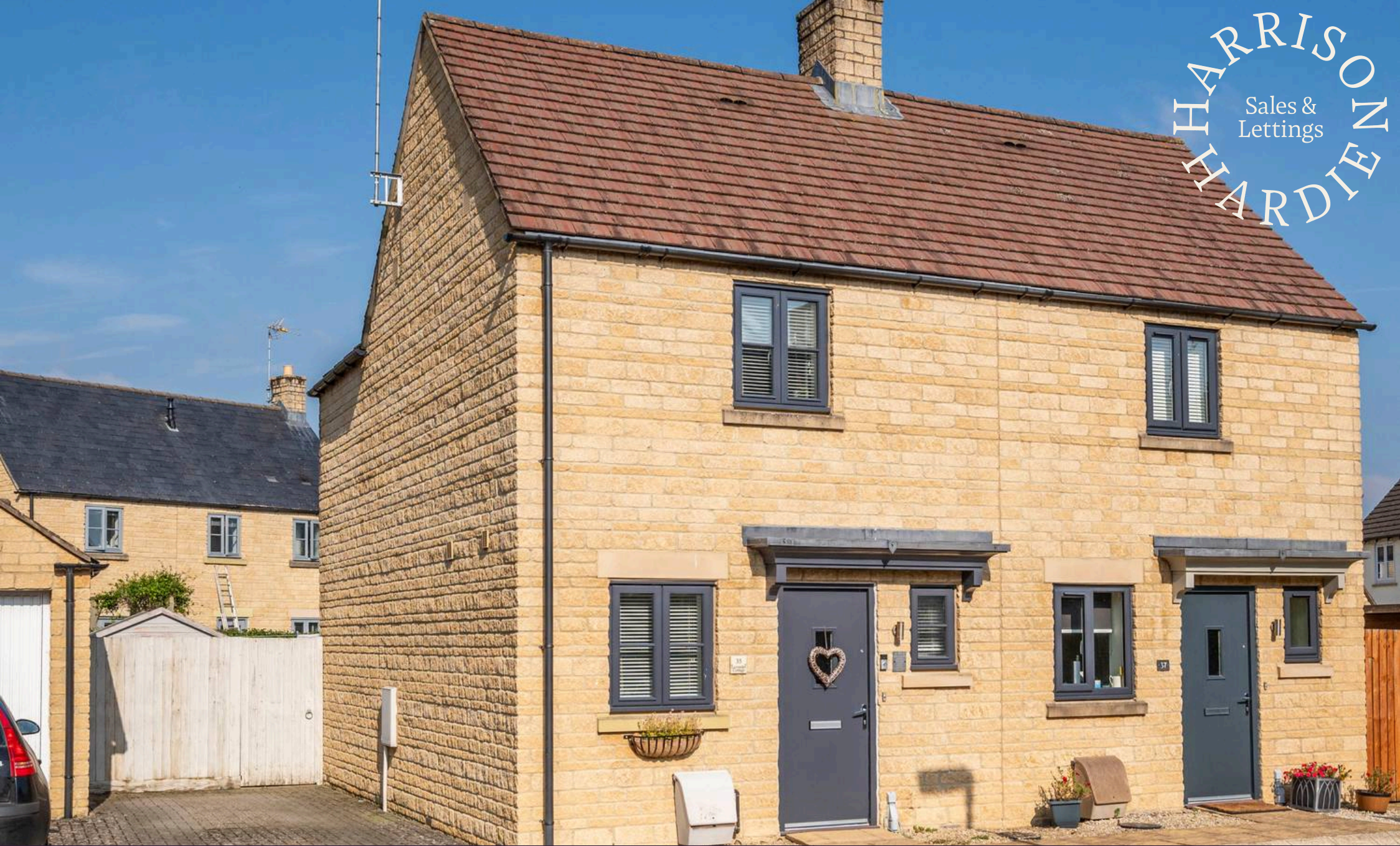
Barnsley Way, Bourton-On-The-Water