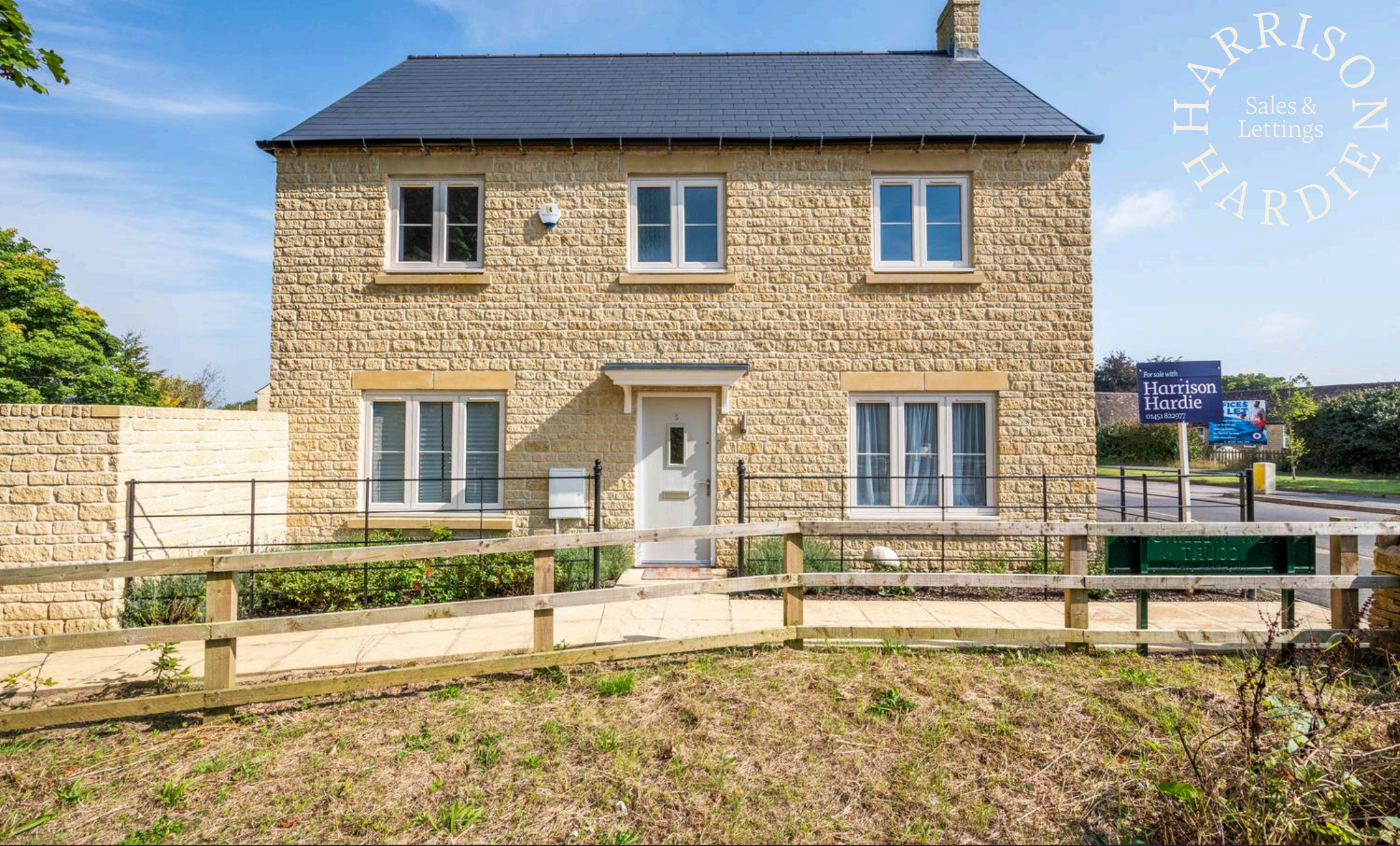
New Wellington Court, Upper Rissington