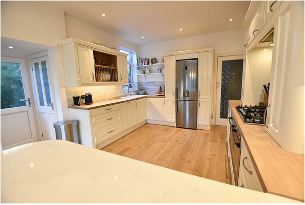
LIVING KITCHEN DINER