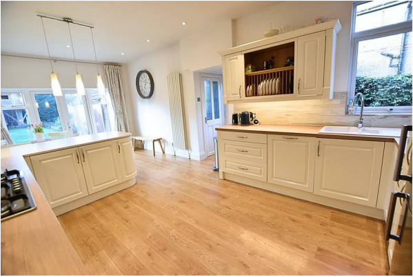
LIVING KITCHEN DINER