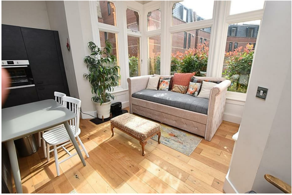
LIVING ROOM 20'4" into bay x 15'10" (6.22 into bay x 4.83)