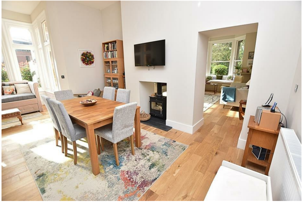
LIVING KITCHEN DINER