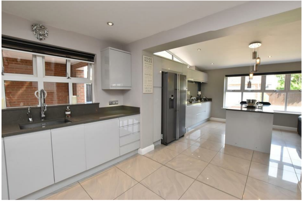
DINING LIVING AREA PHOTO