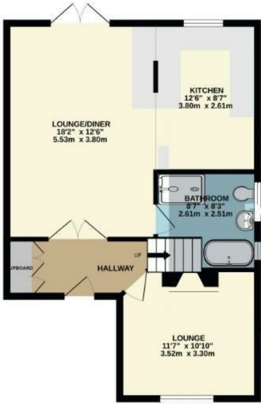
GROUND FLOOR 574 sq.ft. (53.4 sq.m.) approx.