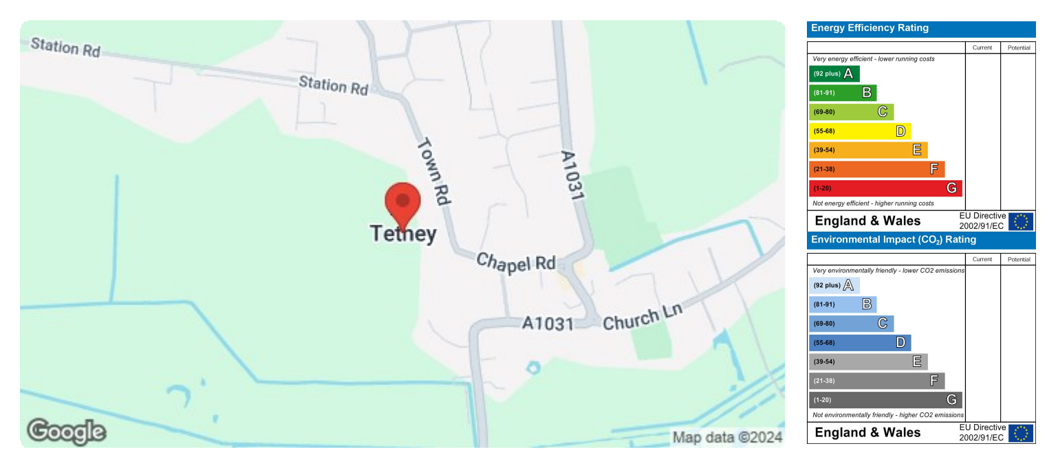
For clarification, we wish to inform prospective purchasers that we have not carried out a detailed survey, nor tested the services, appliances and specific fittings for this property. All measurements and floor plans provided are approximate and for guidance purposes only. The particulars are set out as a general outline only for the guidance of intending purchasers or lesses, and do not constitute any part of an offer or contract. All descriptions, dimensions, references to condition and necessary permissions for use and occupation, and other details are given in good faith and are believed to be correct and any intending purchaser or tenant should not rely on them as statements or representations of fact but must satisfy themselves by inspection or otherwise as to the correctness of each of them. No person in the firms employment Ltd has any authority to make or give any representation or warranty whatever in relation to this property. If there is any point which is of particular importance to you, please contact the office and we will be pleased to check the information, particularly if you contemplate travelling some distance to view the property.