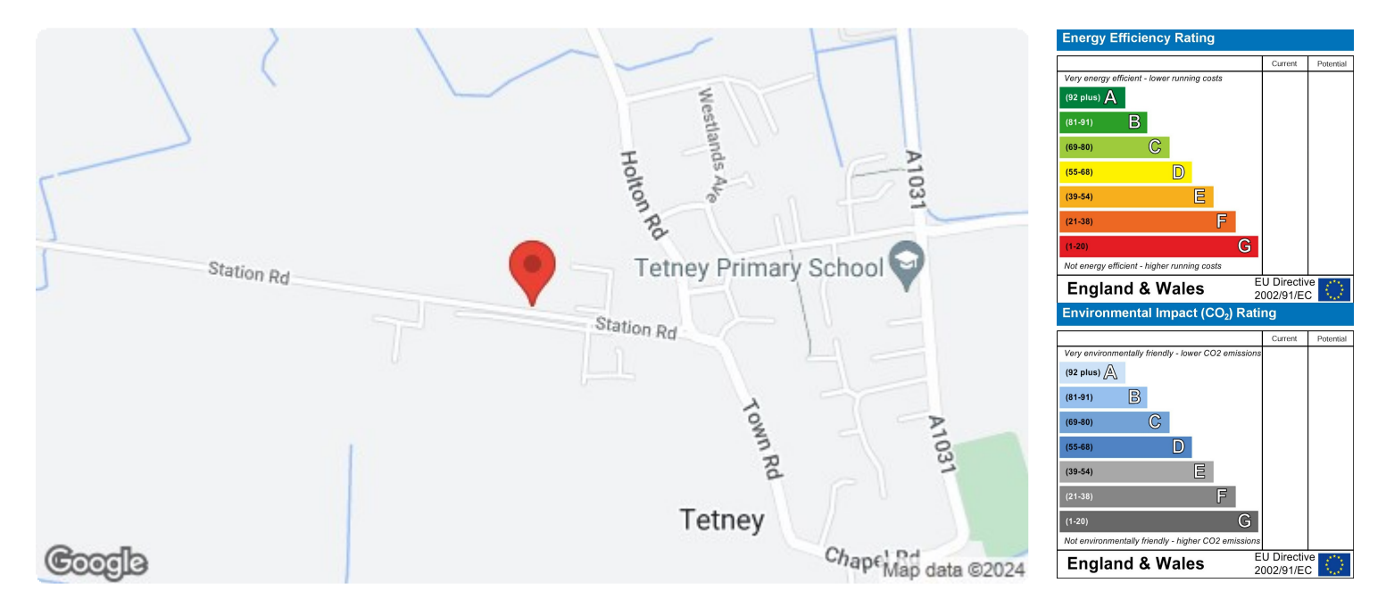
For clarification, we wish to inform prospective purchasers that we have not carried out a detailed survey, nor tested the services, appliances and specific fittings for this property. All measurements and floor plans provided are approximate and for guidance purposes only. The particulars are set out as a general outline only for the guidance of intending purchasers or lesses, and do not constitute any part of an offer or contract. All descriptions, dimensions, references to condition and necessary permissions for use and occupation, and other details are given in good faith and are believed to be correct and any intending purchaser or tenant should not rely on them as statements or representations of fact but must satisfy themselves by inspection or otherwise as to the correctness of each of them. No person in the firms employment Ltd has any authority to make or give any representation or warranty whatever in relation to this property. If there is any point which is of particular importance to you, please contact the office and we will be pleased to check the information, particularly if you contemplate travelling some distance to view the property.