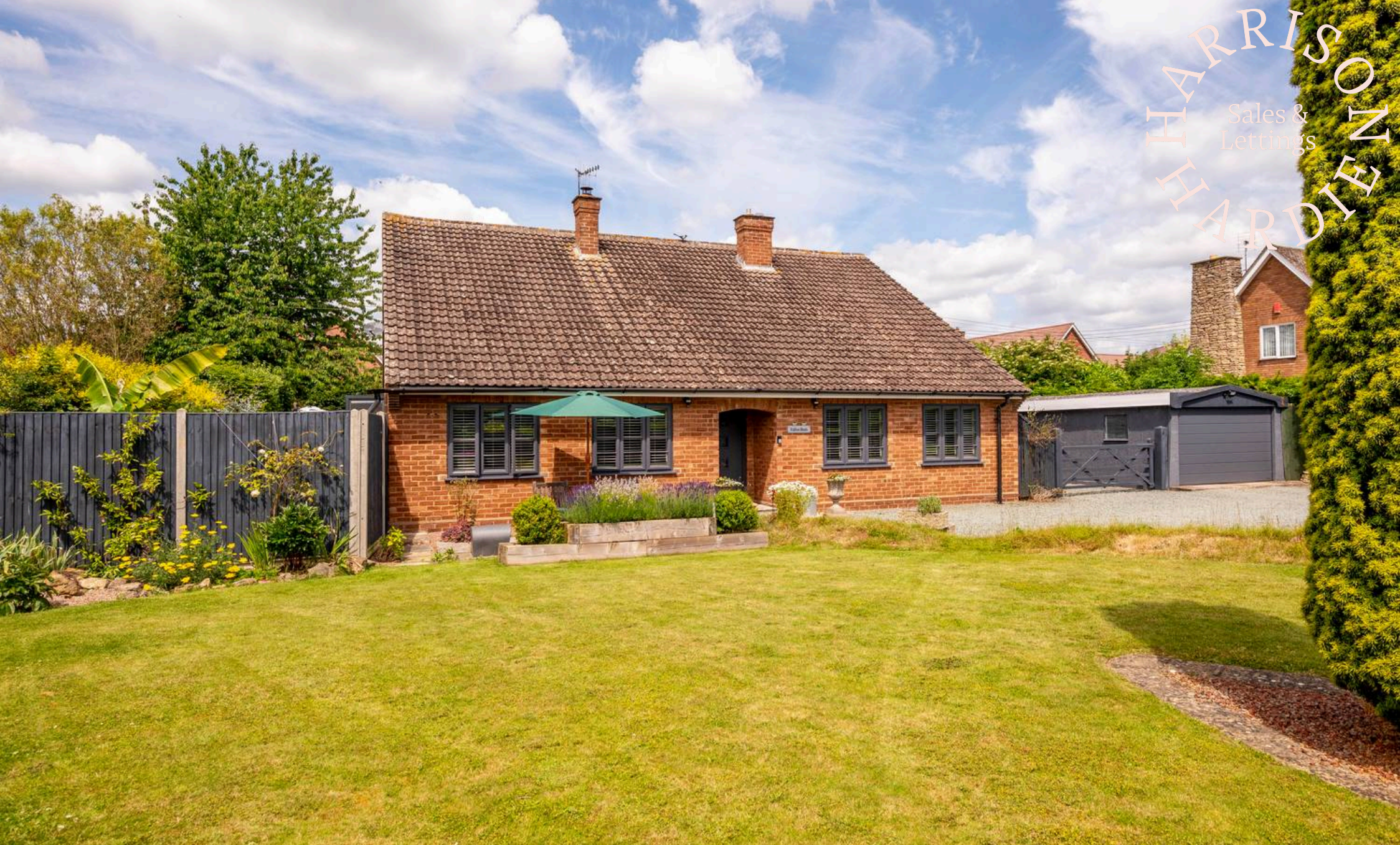
Fallon Lane, Bretforton Evesham