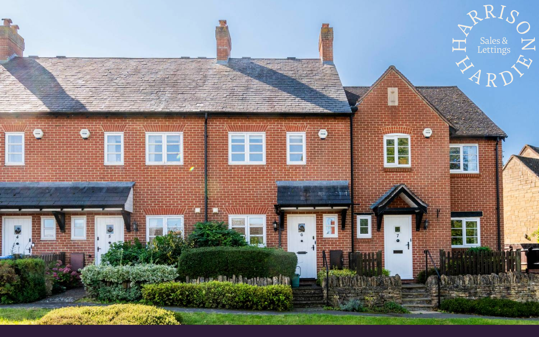
The Green, Stretton On Fosse