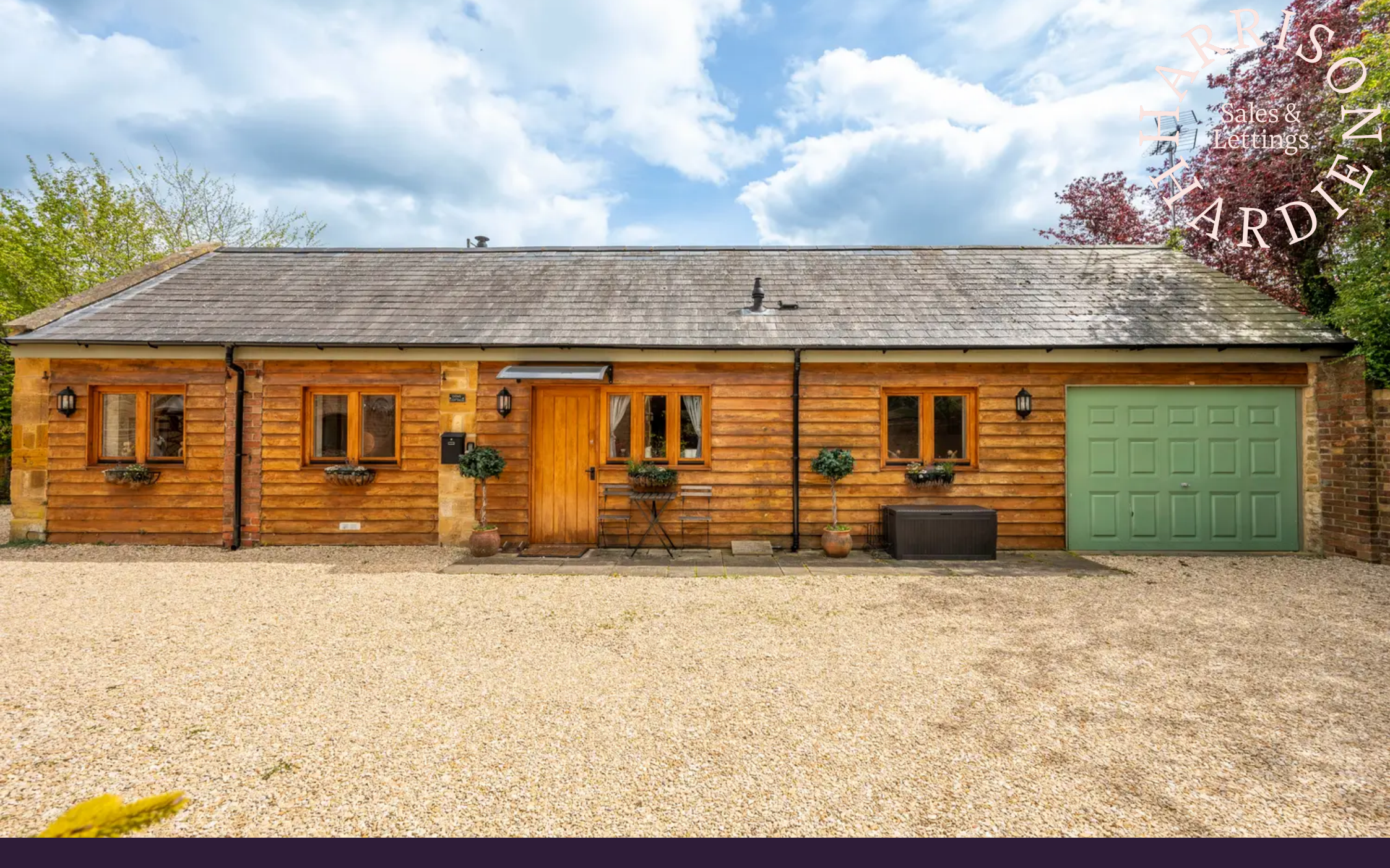
Dove Cottage New Road, Moreton-In-Marsh