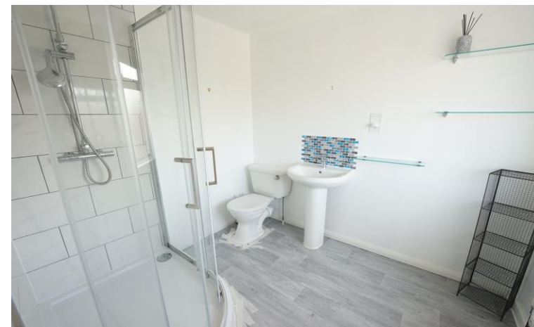
The en suite shower room