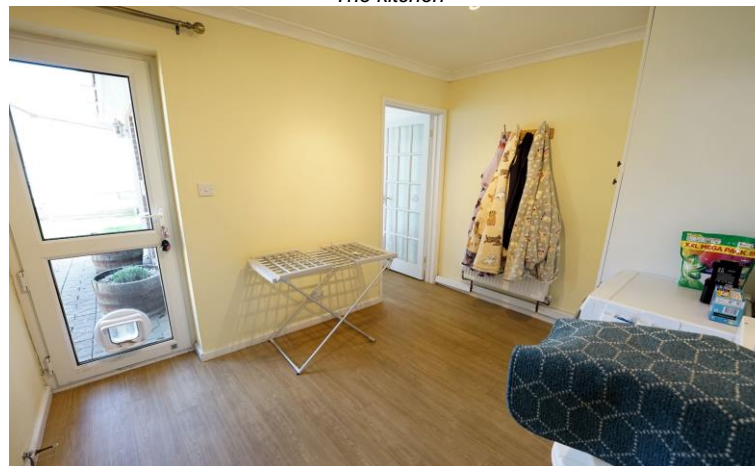
The utility room

There is an integral garage with light, power and a roller door, while a path allows access via the side of the house to the rear.