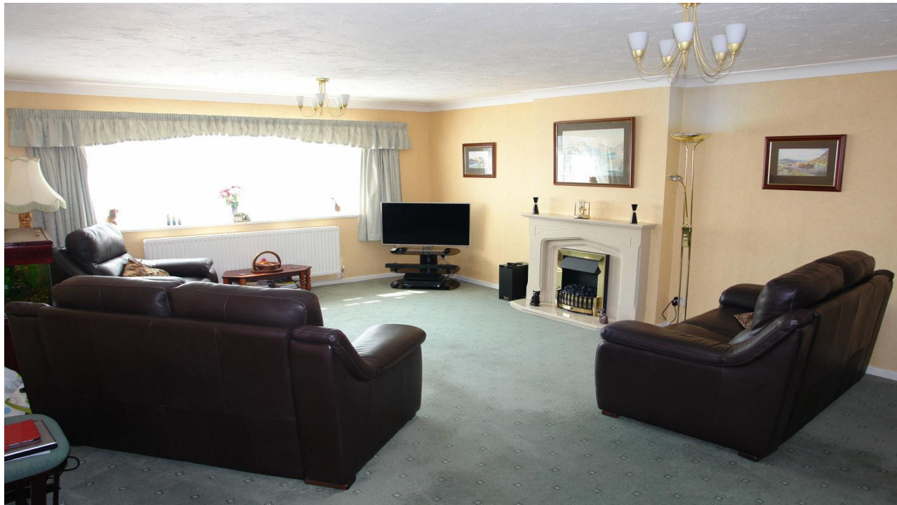
The spacious living room

The property has been thoughtfully and very successfully extended over the years and now offers generous and well-balanced accommodation ideal for family living with excellent ground floor pace and superb double bedrooms.