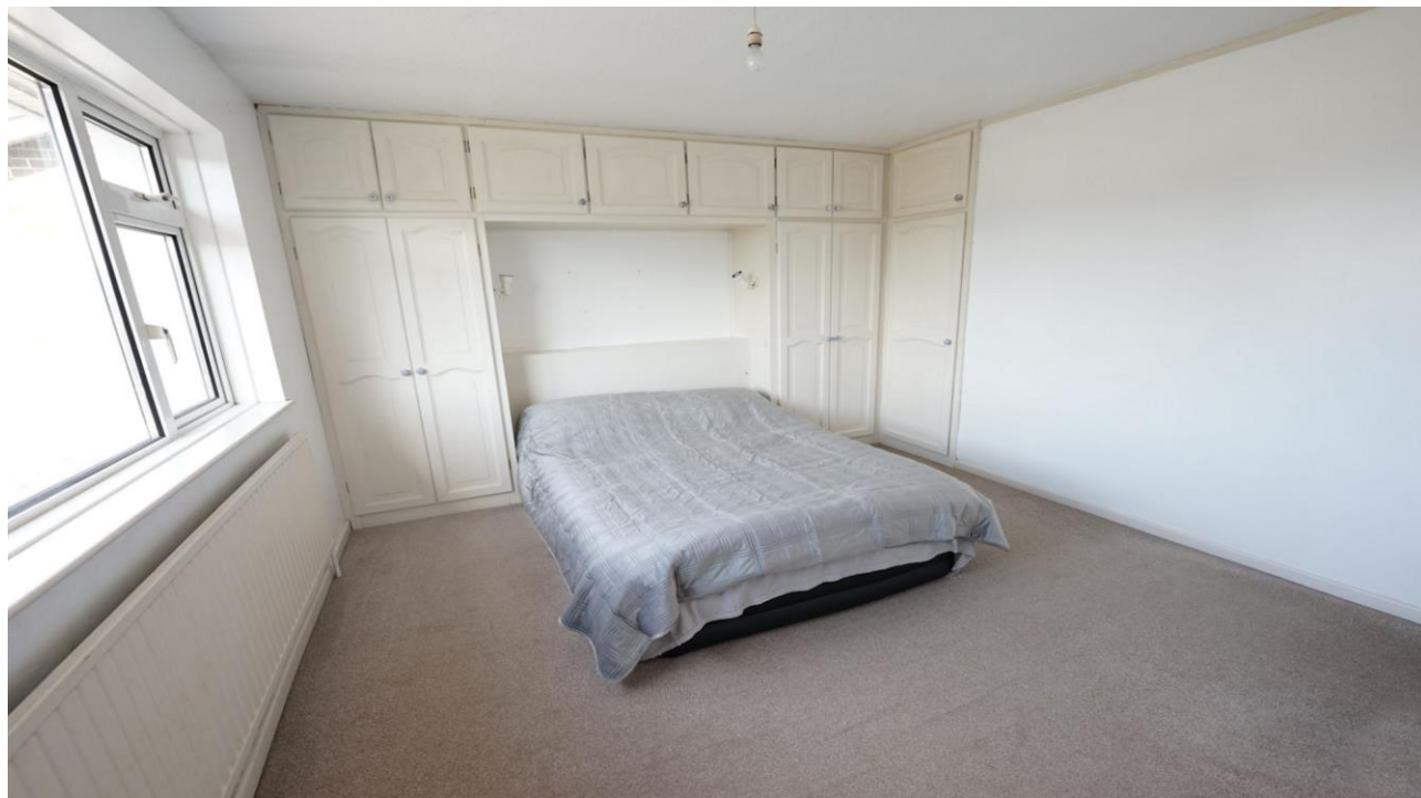
The principal bedroom

The drive provides good parking and an area of gravel to the side further reduces maintenance and offers additional parking if needed.