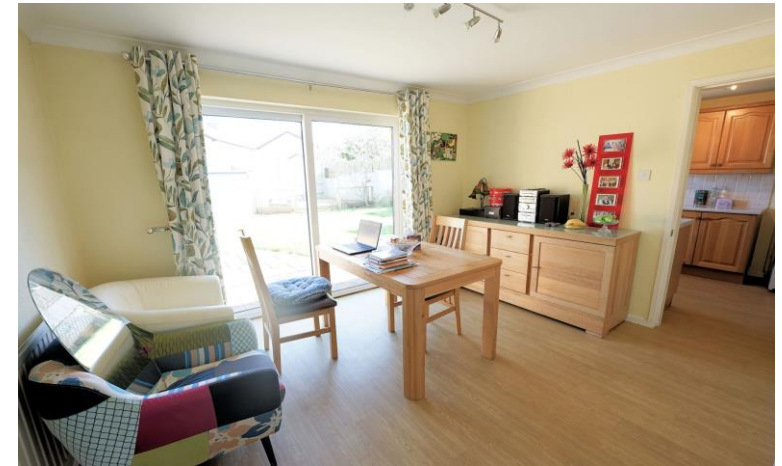
The dining room