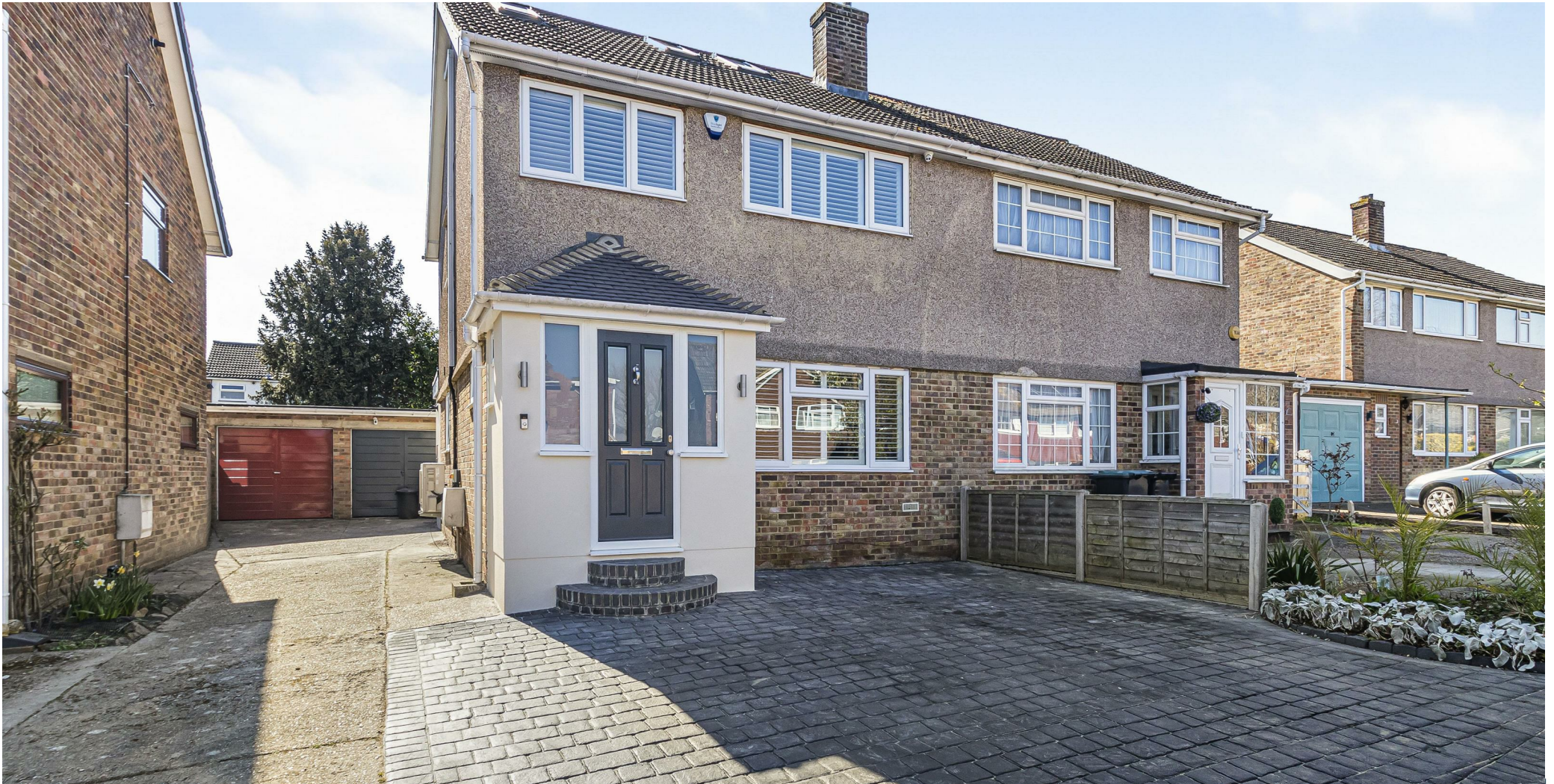
7 Walnut Tree Way Meopham, DA13 0EH Freehold