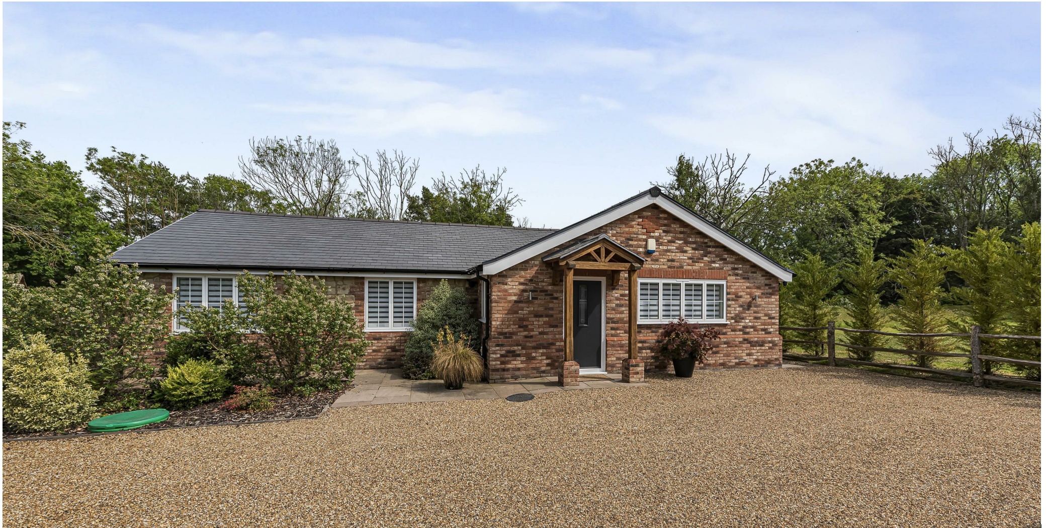
Lakeview Ford Lane Trottiscliffe, ME19 5DP Freehold