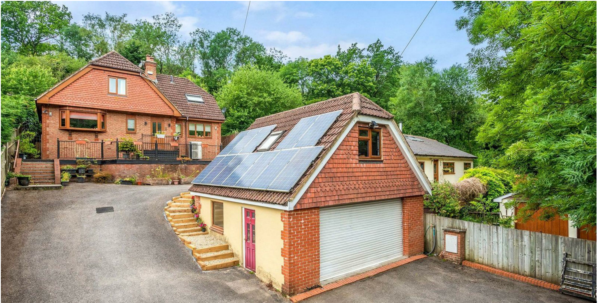
Valley High Valley Lane Culverstone, Kent, DA13 0DQ Freehold