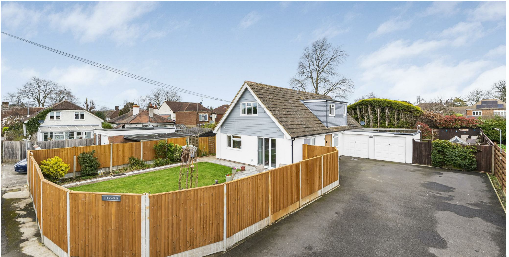
The Gables Sole Street Cobham, Kent, DA12 3AX Freehold