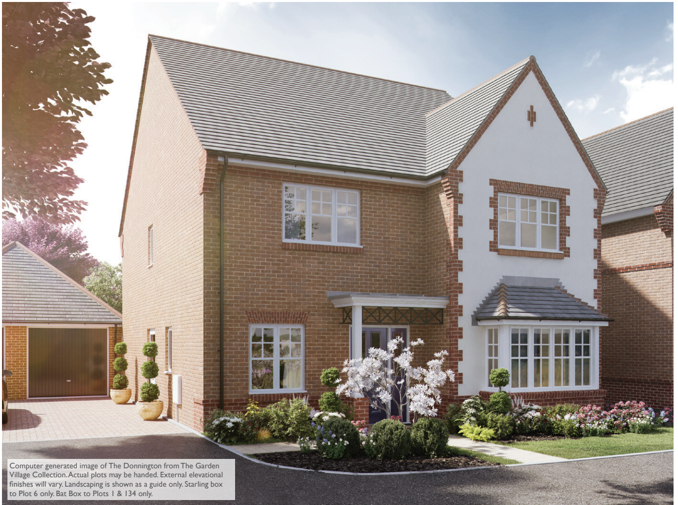
Computer generated image of The Donnington from The Garden Village Collection. Actual plots may be handed. External elevational finishes will vary. Landscaping is shown as a guide only. Starling box to Plot 6 only. Bat Box to Plots 1 & 134 only.