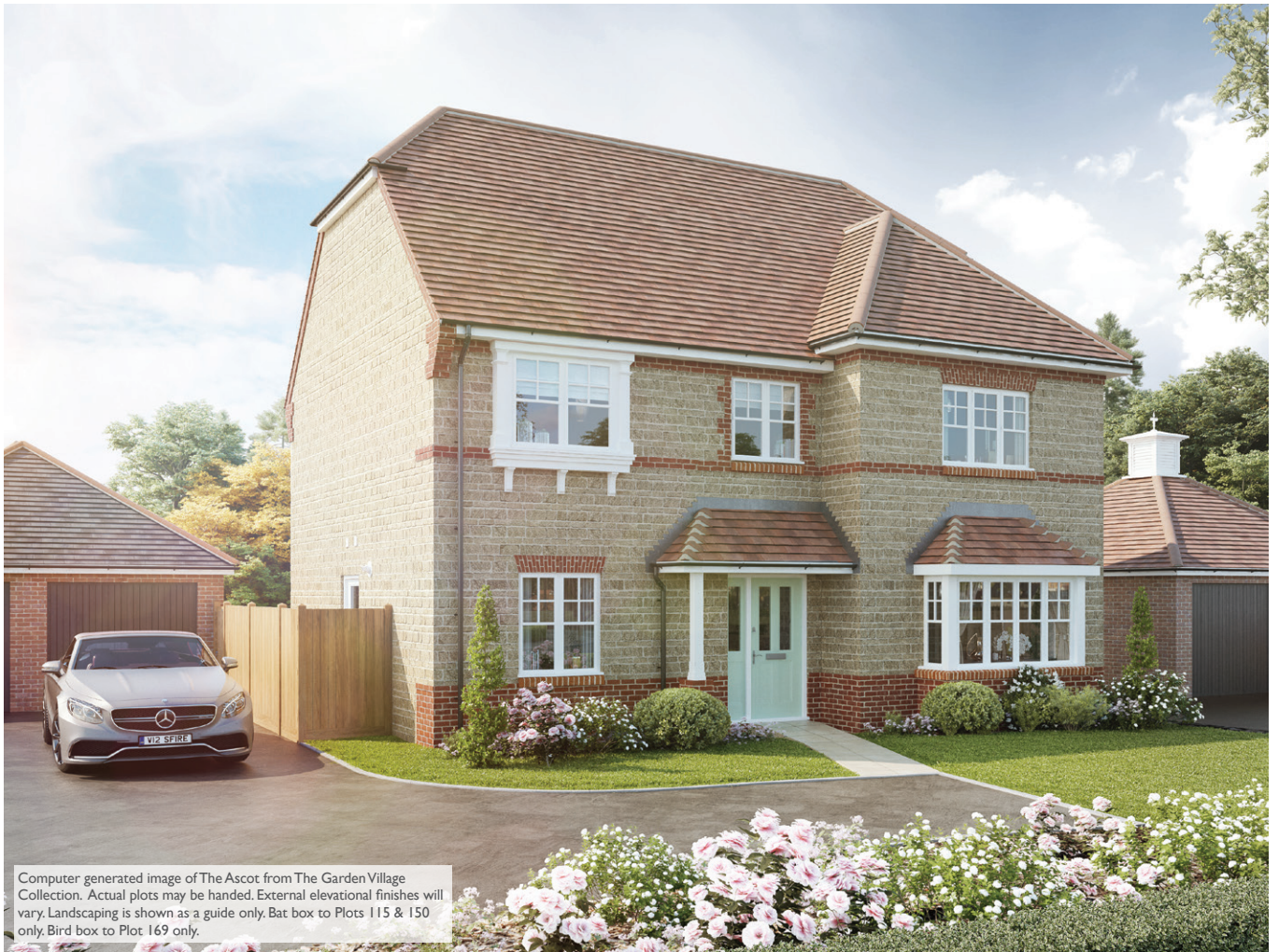
Computer generated image of The Ascot from The Garden Village Collection. Actual plots may be handed. External elevational finishes will vary. Landscaping is shown as a guide only. Bat box to Plots 115 & 150 only. Bird box to Plot 169 only.