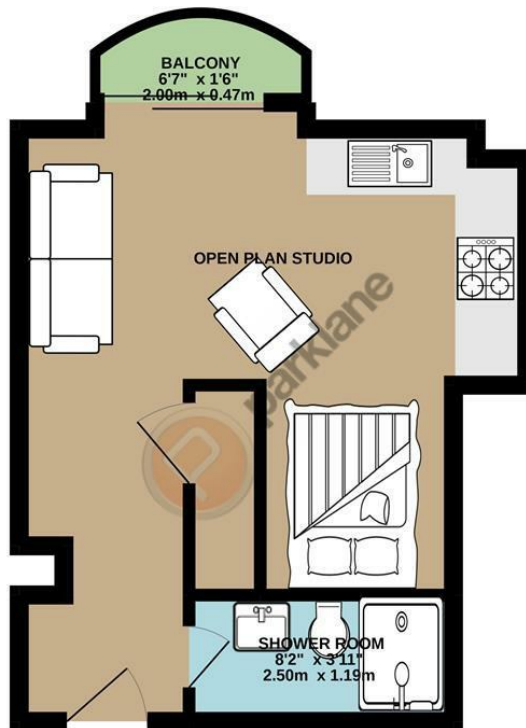
TOTAL FLOOR AREA : 267 sq.ft. (24.8 sq.m.) approx.

Whilst every attempt has been made to ensure the accuracy of the floorplan contained here, measurements of doors, windows, rooms and any other items are approximate and no responsibility is taken for any error, omission or mis-statement. This plan is for illustrative purposes only and should be used as such by any prospective purchaser. The services, systems and appliances shown have not been tested and no guarantee as to their operability or efficiency can be given. Made with Metropix ©2022