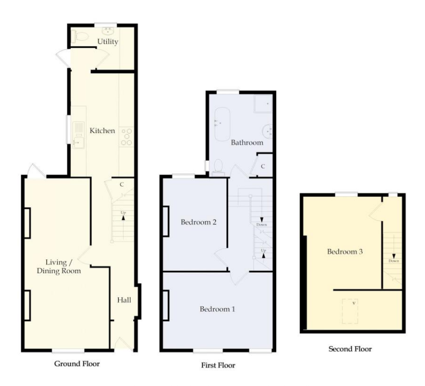
This drawing is for illustrative purposes only (not to scale) Capyright © 2024 ViewPlan.co.uk (Ref. VP24-MIT-1, Rev. Org.)