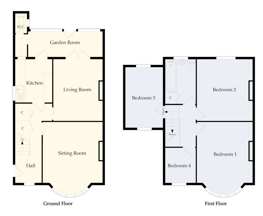
This drawing is for illustrative purposes only (not to scale) Copyright © 2024 ViewPlan.co.uk (Ref: VP24-OIT-2, Rev: Org)