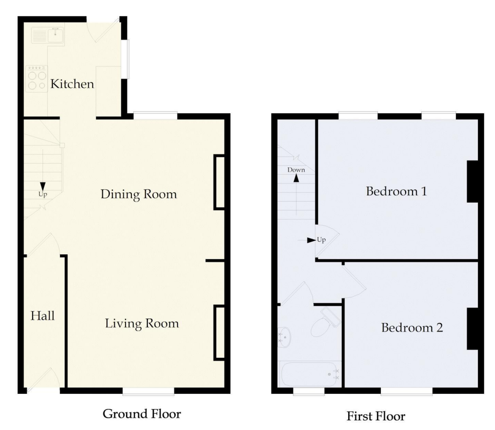
This drawing is for illustrative purposes only (not to scale) Copyright © 2024 ViewPlan.co.uk (Ref: VP24-HHT-3, Rev: Org)