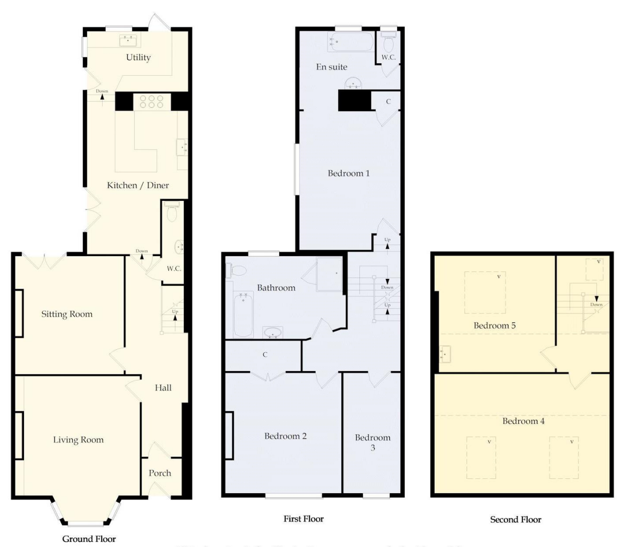
This drawing is for illustrative purposes only (not to scale) Copyright © 2024 ViewPlan.co.uk (Ref: VP24-WFT-1, Rev: Org)