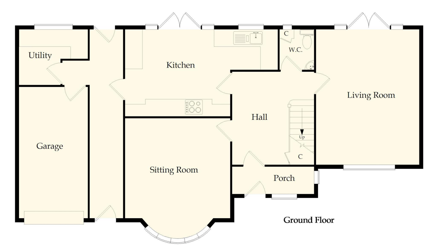
This drawing is for illustrative purposes only (not to scale) Copyright © 2024 ViewPlan.co.uk (Ref. VP24-FCT-2, Rev. Org)