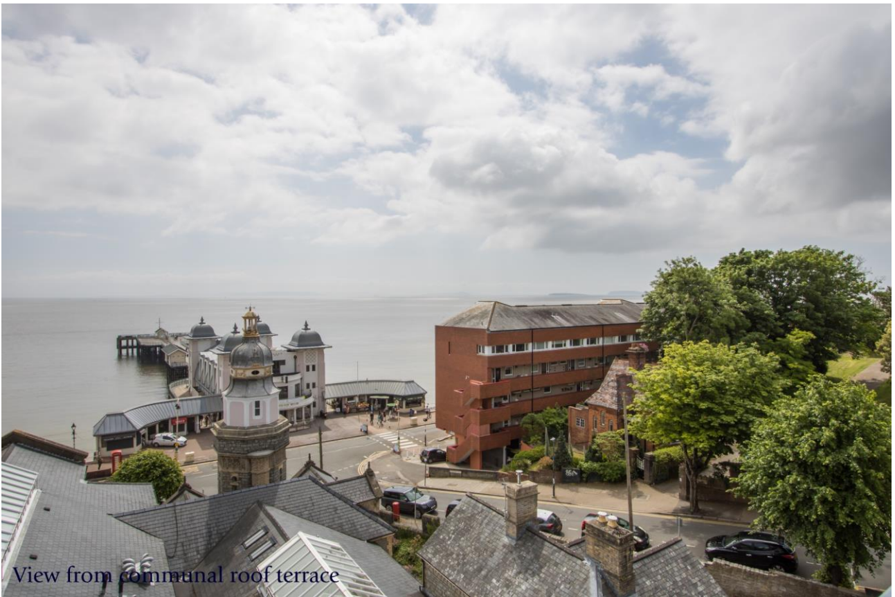
View from communal roof terrace