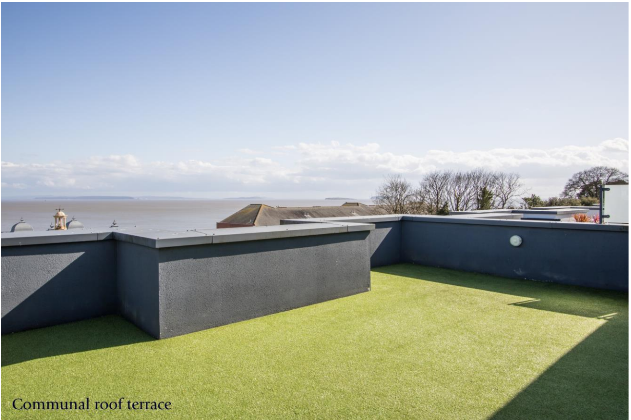
Communal roof terrace