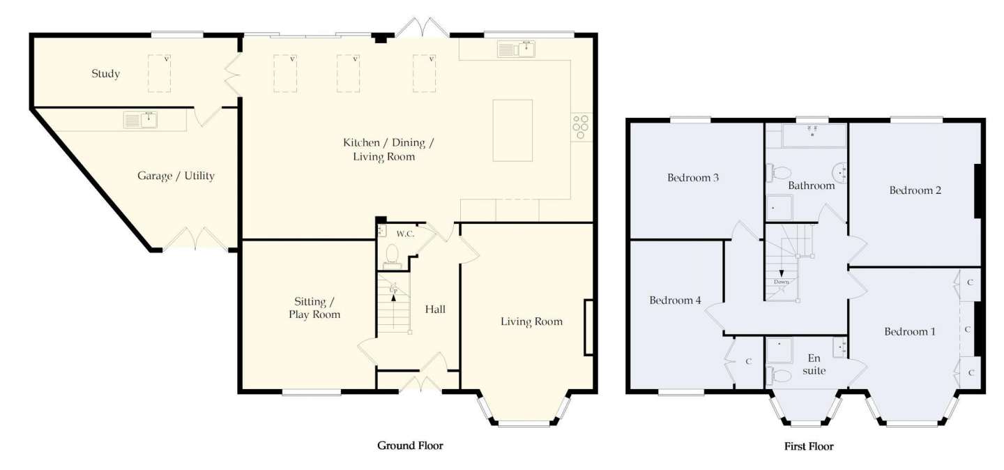
This drawing is for illustrative purposes only (not to scale) Copyright © 2023 ViewPlan.co.uk (Ref. VP24-ZES-1, Rev. Org)