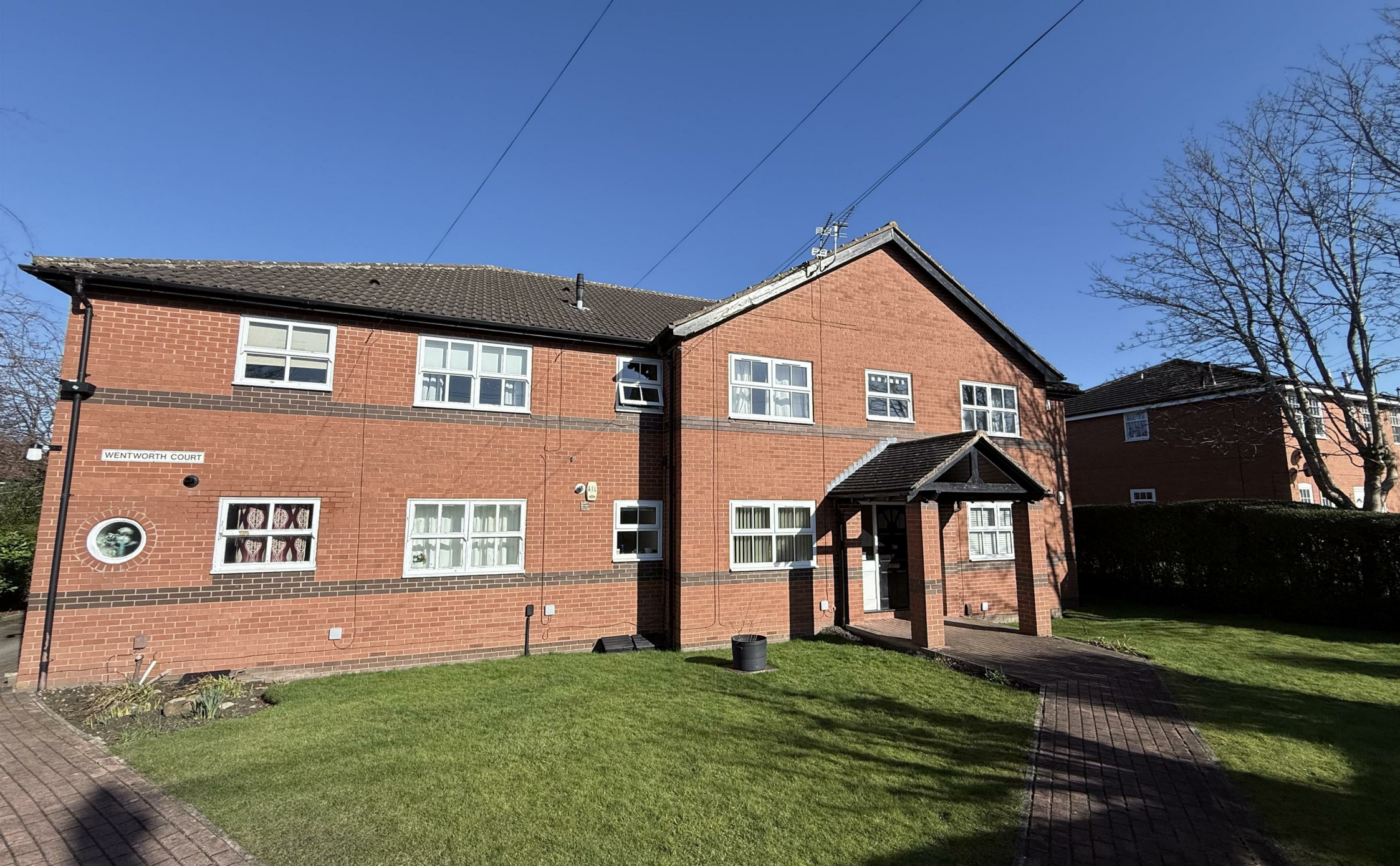
Wentworth Court 42 Nursery Lane, Alwoodley £180,000