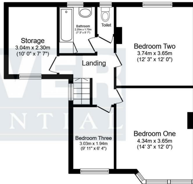
First Floor Floor area 54.7 sq.m. (589 sq.ft.)

Total floor area: 123.4 sq.m. (1,328 sq.ft.)