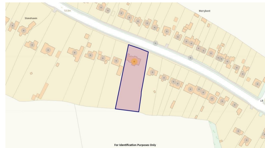
For Identification Purposes Only

Total area: approx. 403.4 sq. metres (4341.8 sq. feet) For identification purposes only. Not to scale. Please consult your solicitor.