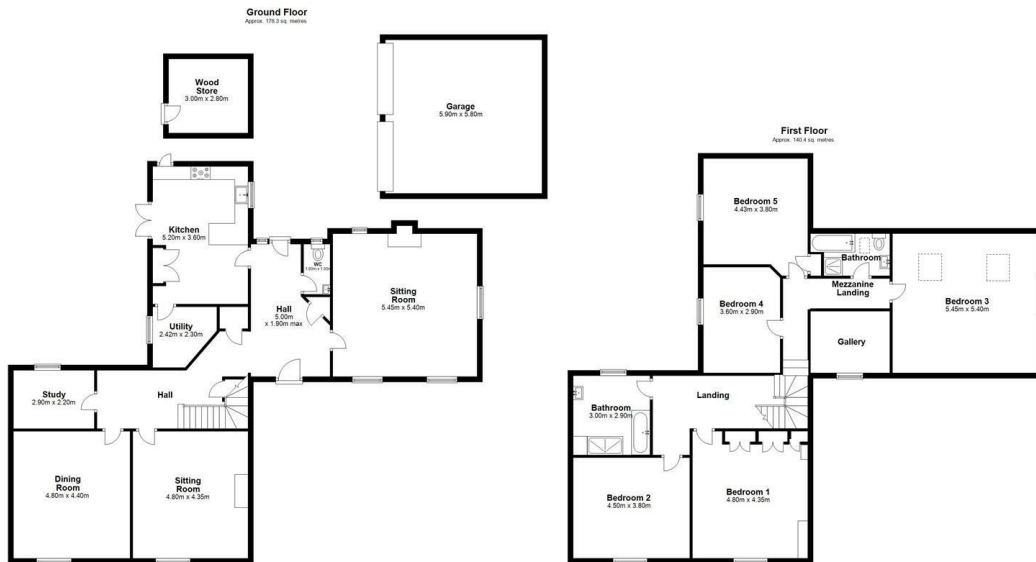
Total area: approx. 318.7 sq. metres. All measurements are for guidance only and are not to scale. Plans are illustrative only. Refer to the actual plans. Pasture View, 4 The Terrace, Croft on Tees