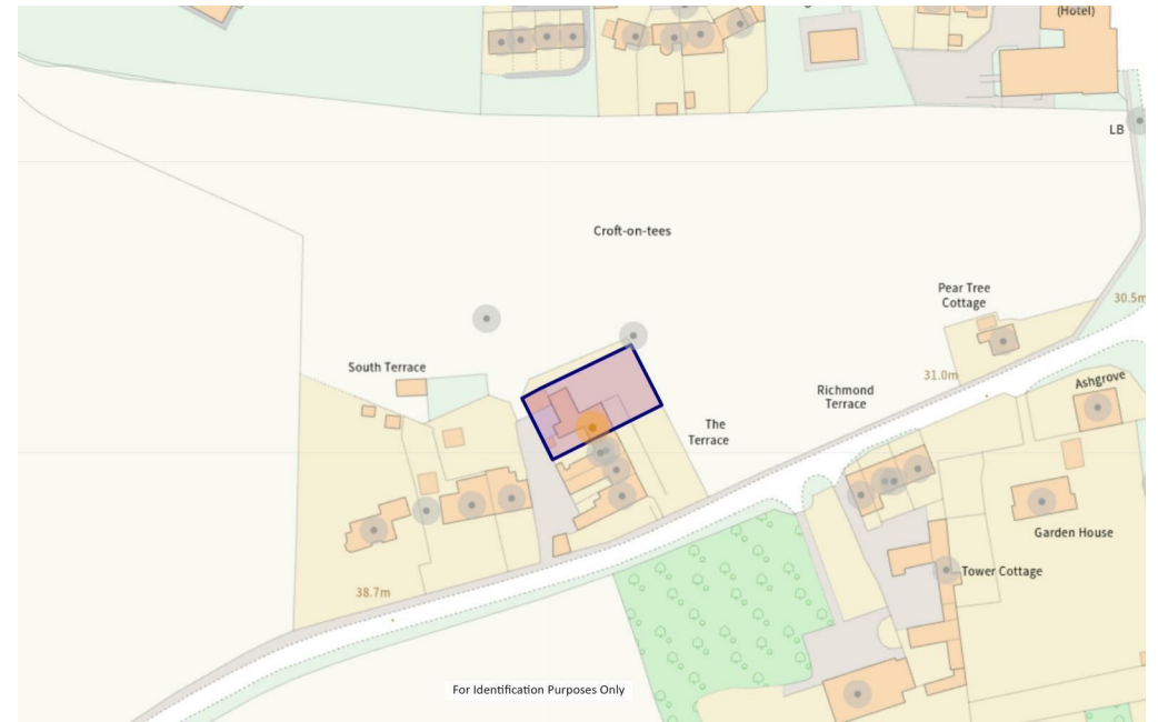
For Identification Purposes Only

We can search 1,000s of mortgages for you