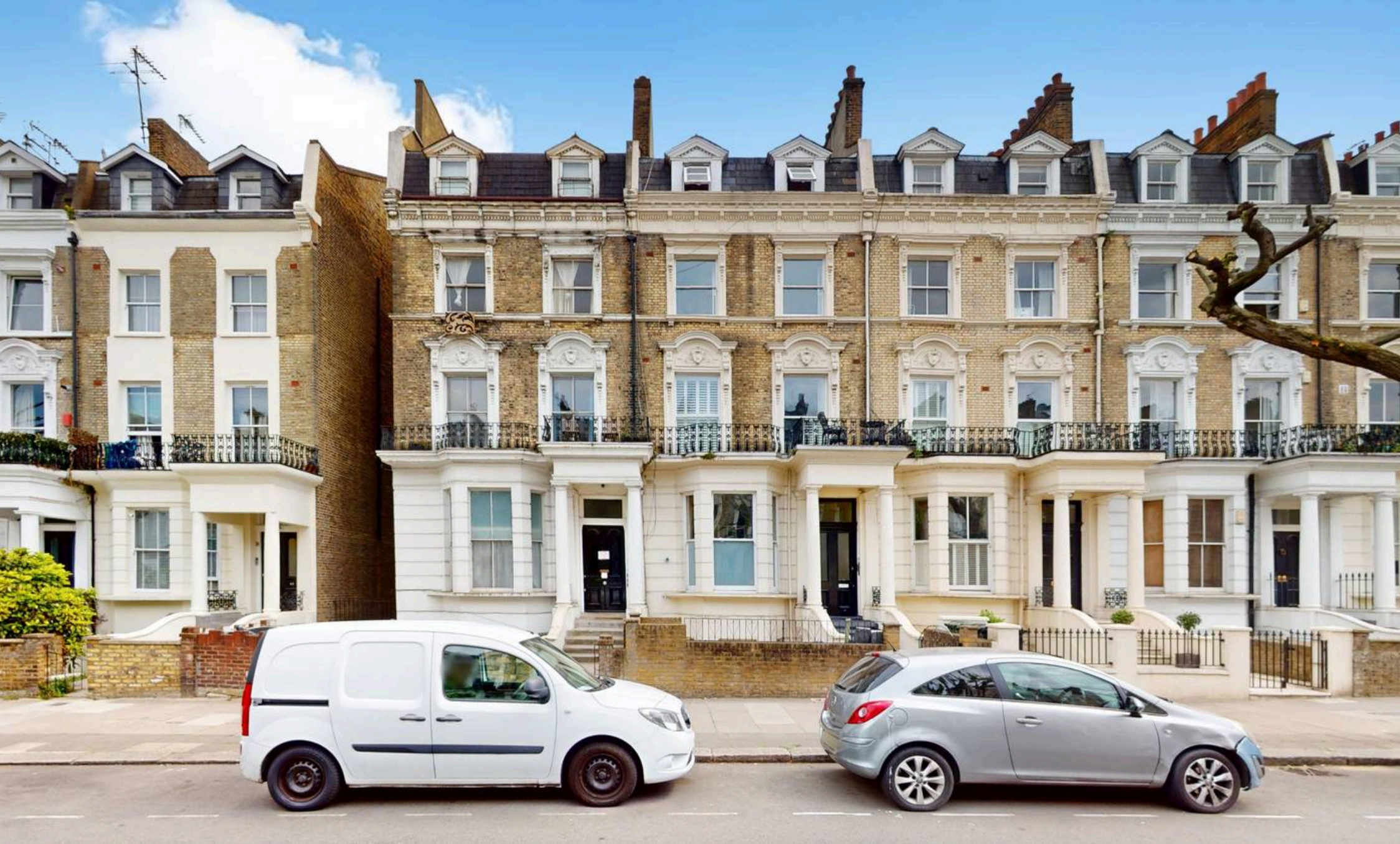
Sutherland Avenue, London, W9 £1,950 pcm