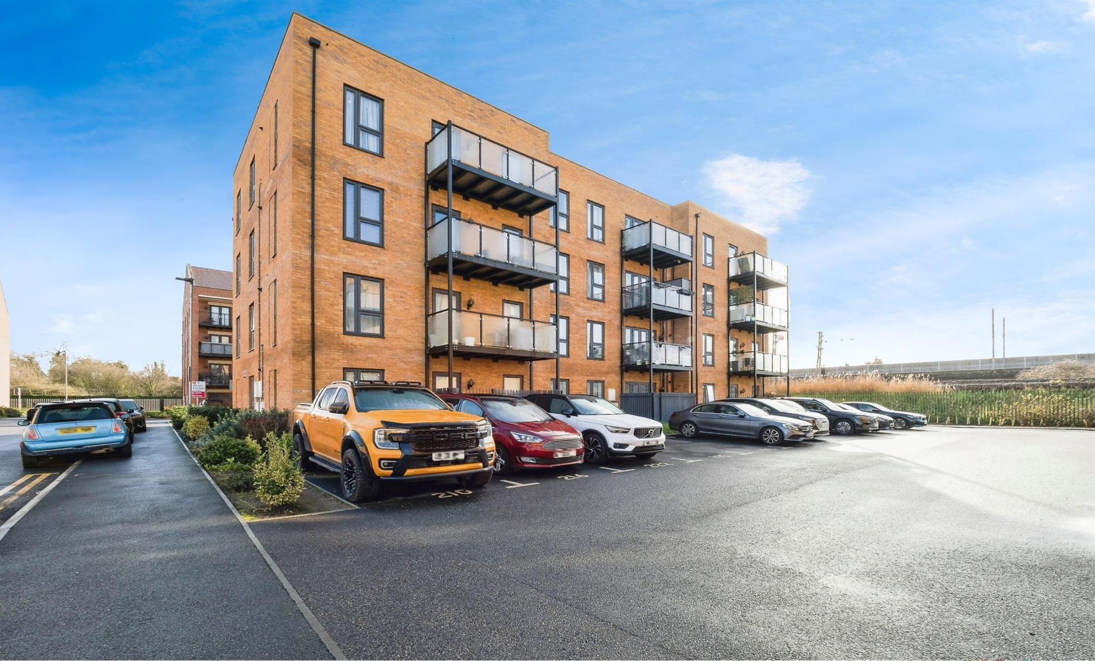
Merchants House, Heriot Road, Rainham, RM13 8QG