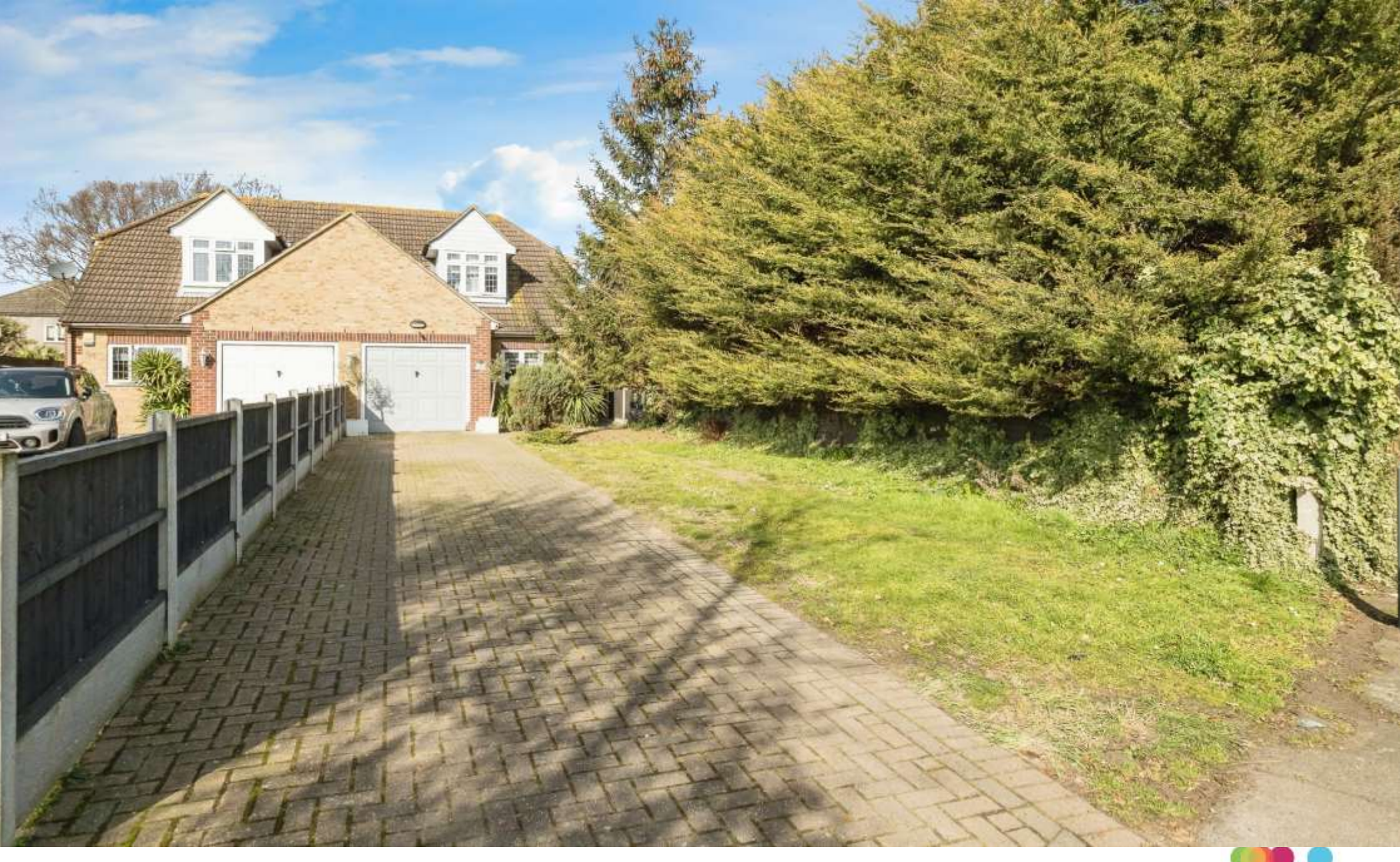
Lambs Lane South, Rainham, RM13 9XJ