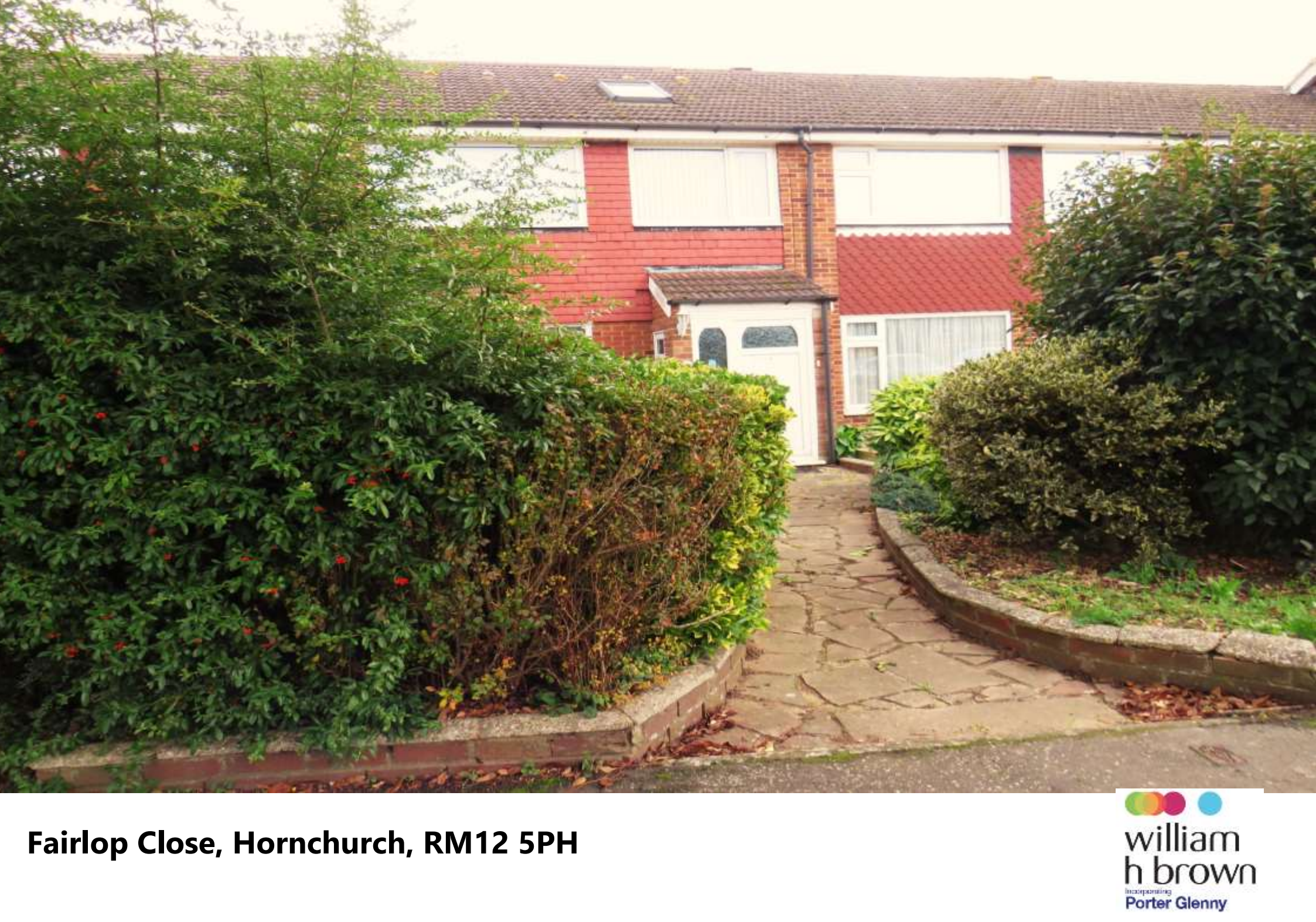
Fairlop Close, Hornchurch, RM12 5PH