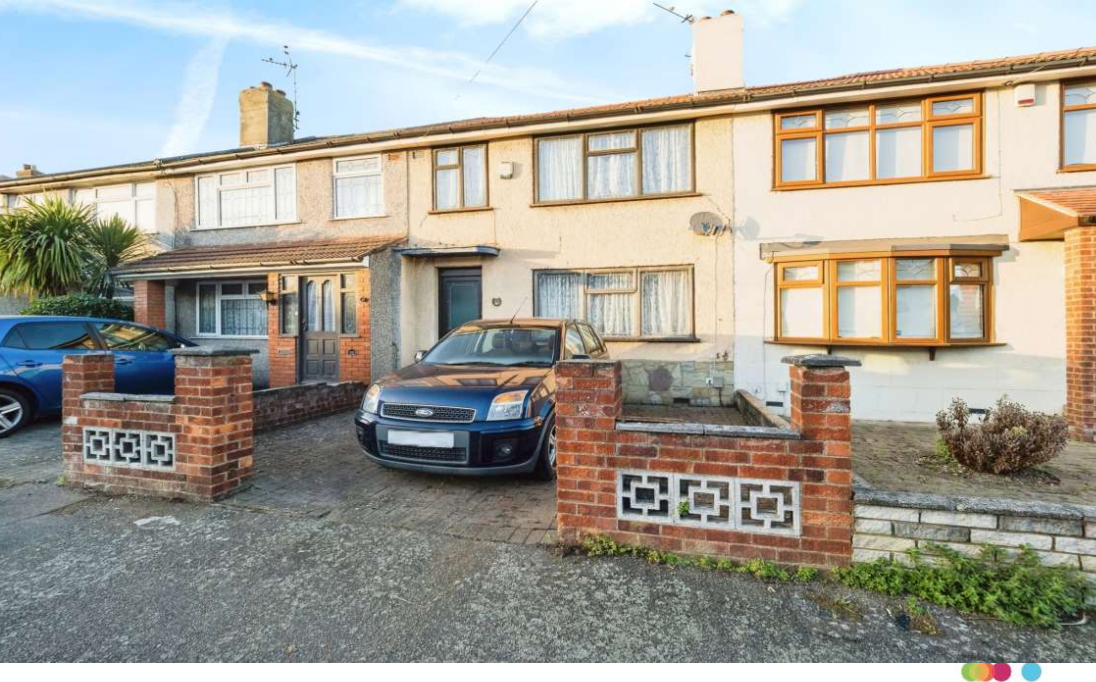
St. Andrews Avenue, Hornchurch, RM12 5DT