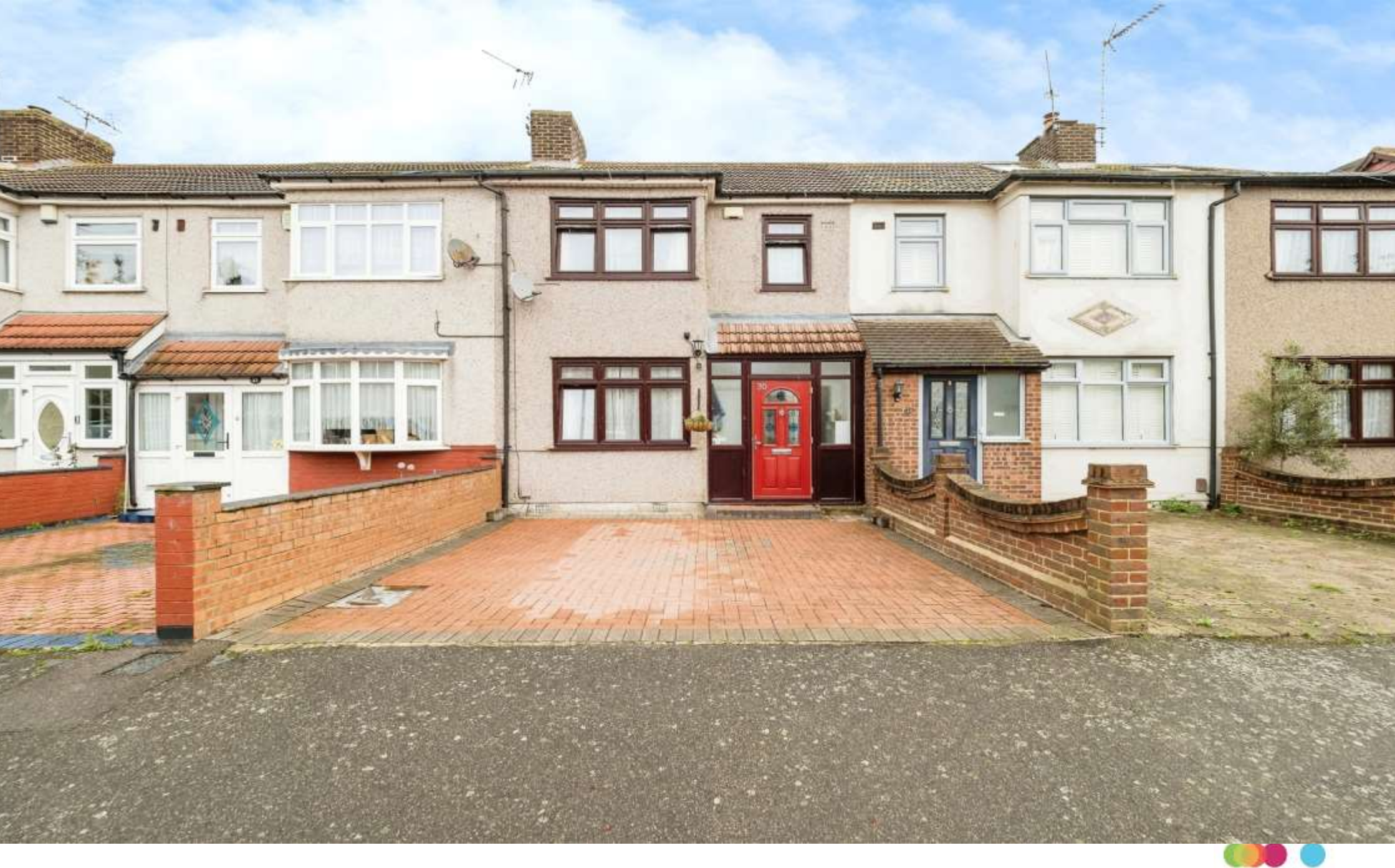
Castle Avenue, RAINHAM, RM13 7TD