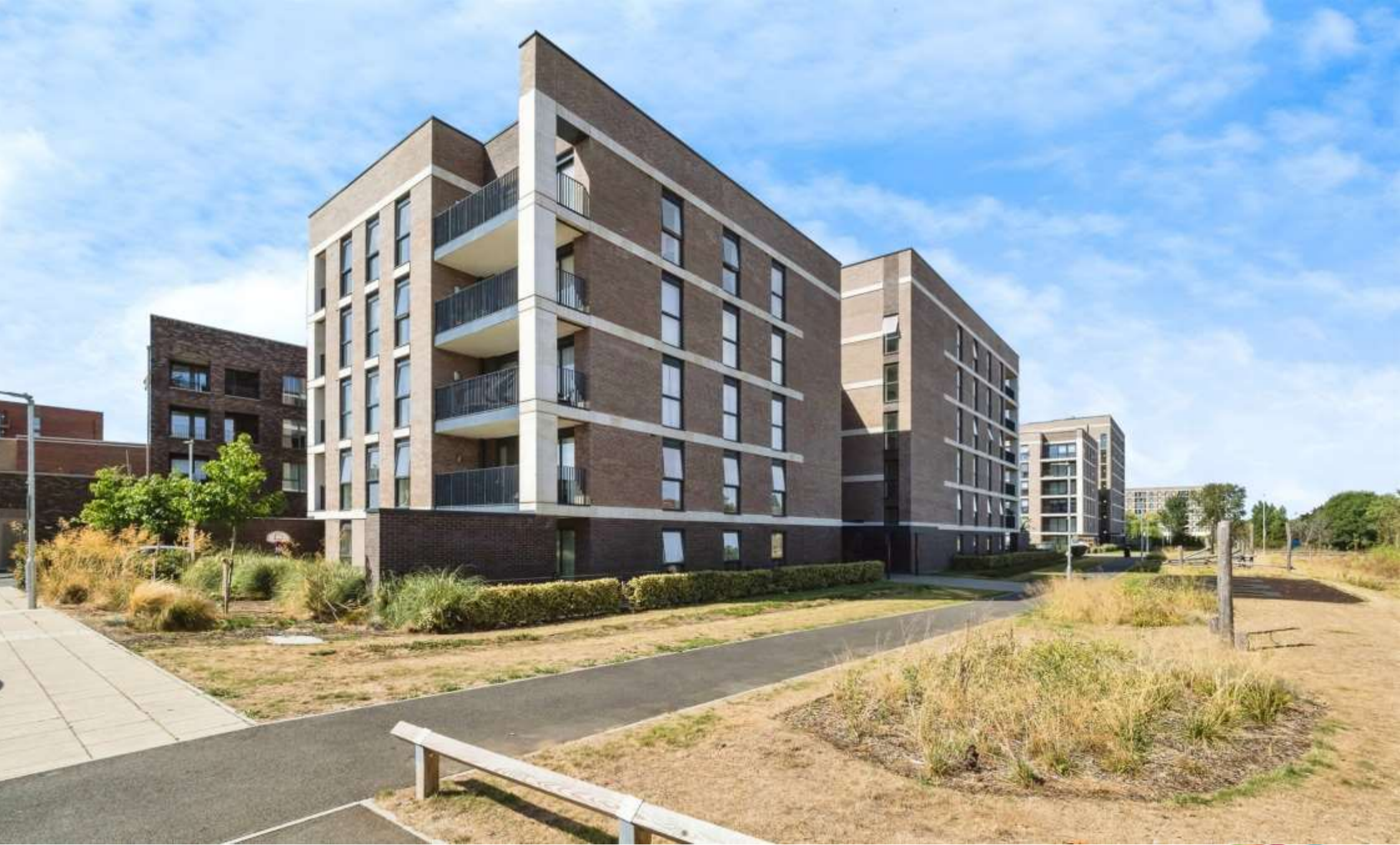
Coburn House, Fairmont Road, RAINHAM, RM13 8RZ