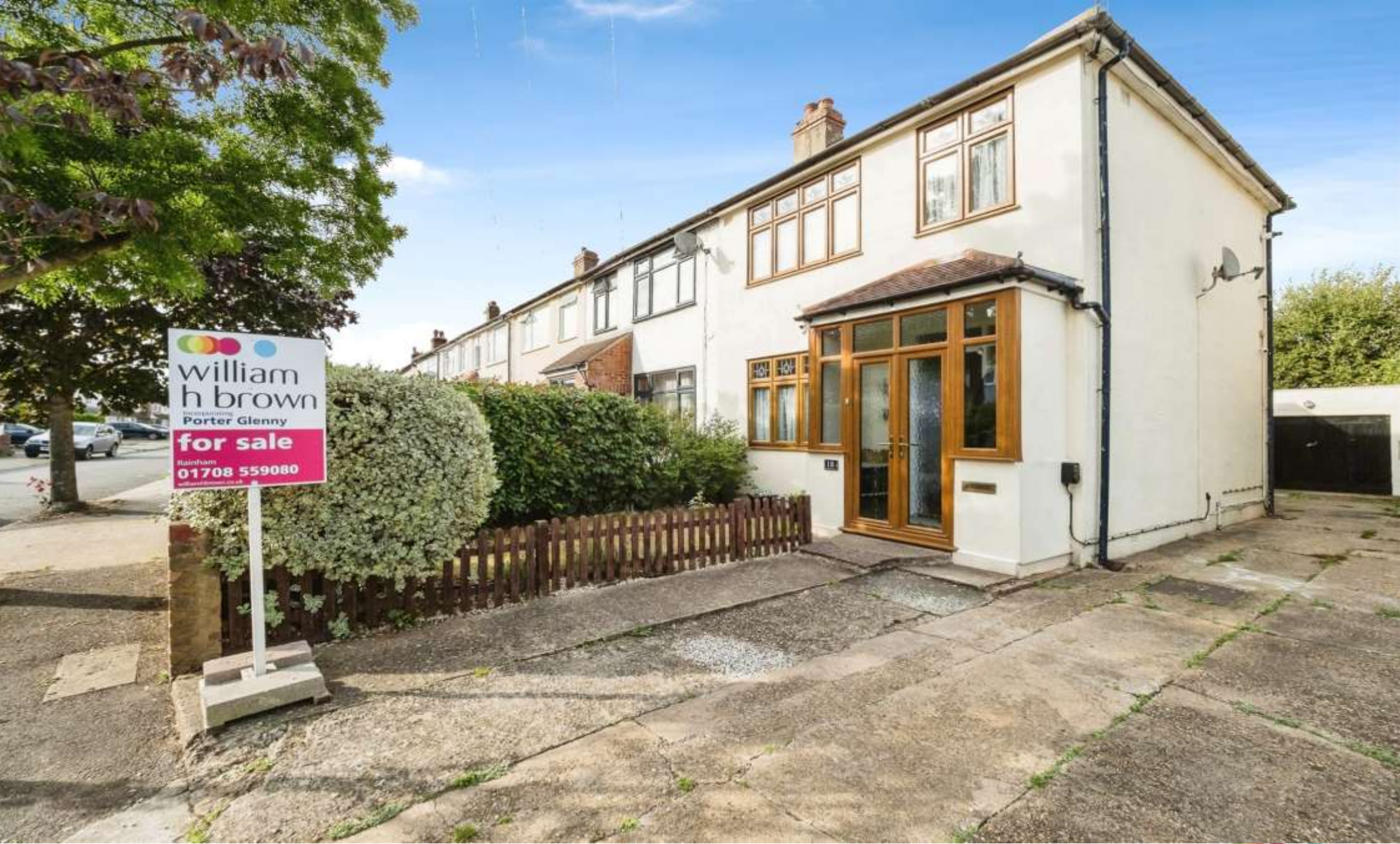
Beechwood Gardens, Rainham, RM13 9HU