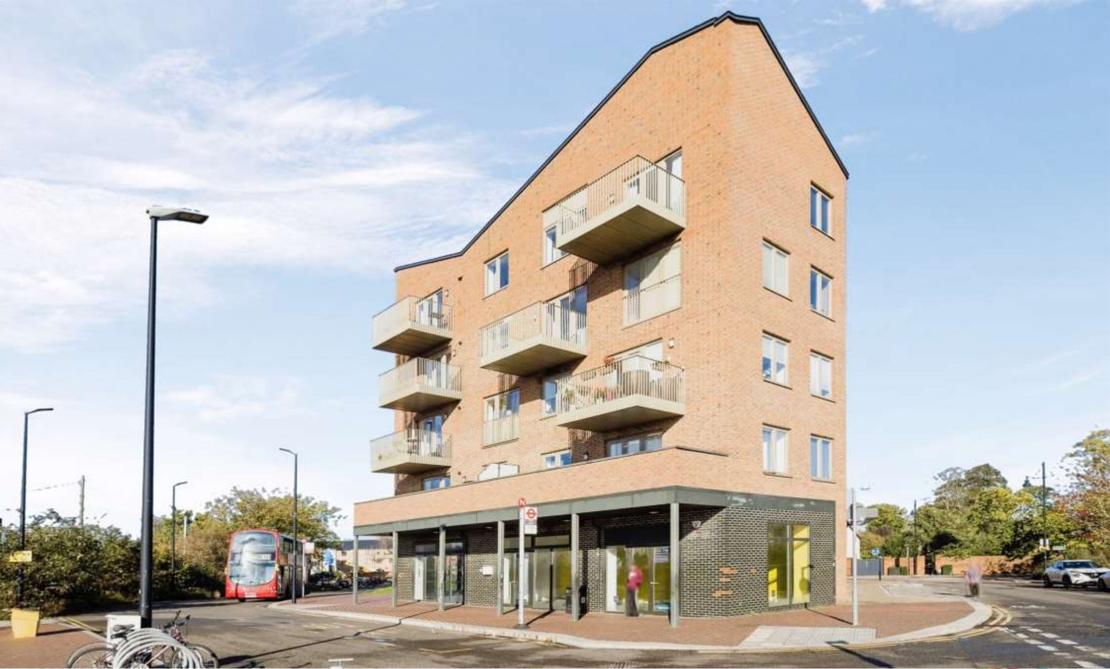
Taplow House Ferry Lane, Rainham, RM13 9FY